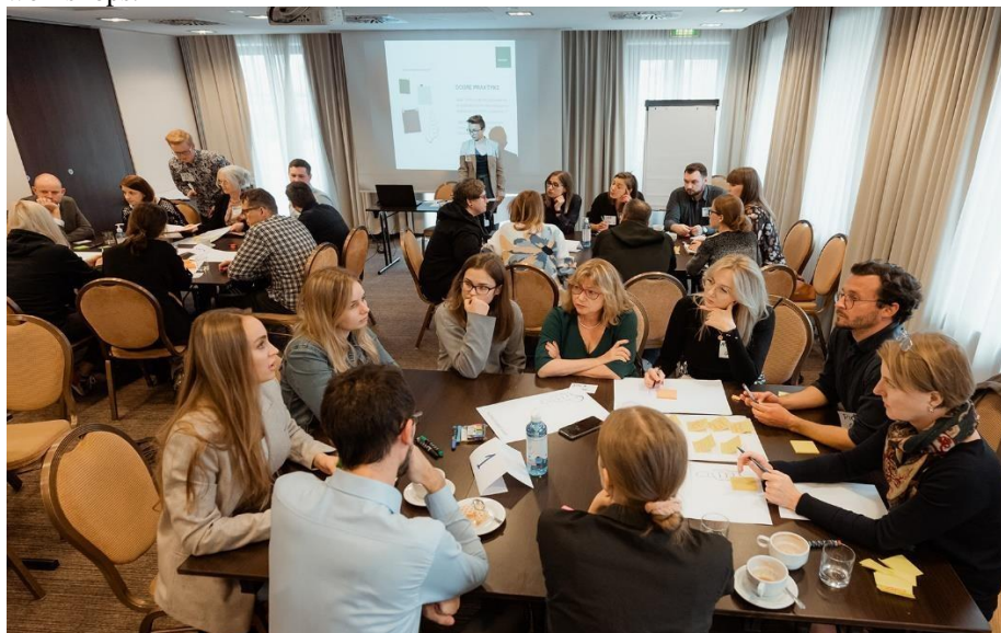
Figure 2. Photo from the co-creation workshop held onsite

A co-creation methodology was used to achieve the objectives of the study. The second phase of the project employed a series of participatory workshops. The first one-day workshop was held stationary (Figure 2). Due to restrictions related to the state of the epidemic, subsequent workshops were held remotely. The cycle of workshops was conducted between October and November 2021. The stationary workshop took place in the city of Gdańsk. The next ones in remote form allowed the participation of residents of other Polish cities. The workshops were attended by local stakeholders active in different thematic areas and occupying different socioprofessional functions. About 50 participants took part in the entire cycle of workshops.