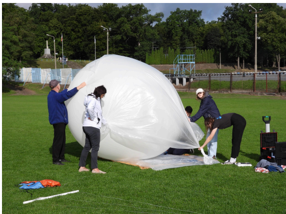
Fig. 6: August 2023 mission during tanking procedure.

The August mission successfully tested the research concept collecting scientific data and demonstrating the team's growing capabilities in scientific exploration. The results will be discussed in future publications by the team.