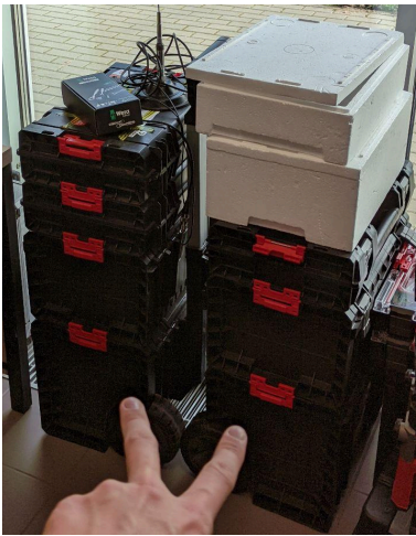
Fig. 2: Prepared equipment before launch.

The first mission after the BEXUS program aimed to introduce new team members of "Stardust NEXT" to the process of conducting a balloon mission. Focus was on preparation and the ground segment, teaching students to organise equipment (Fig. 2 & 3) and follow procedures. This mission was divided into three phases: launchsite preparation, tanking & launch procedures, and tracking, chase & landing. The payload was a simple radiosonde with a camera attached. Students learned key skills, such as the tanking procedure, using balloon tracking software, and managing the unique challenges of a car balloon chase.