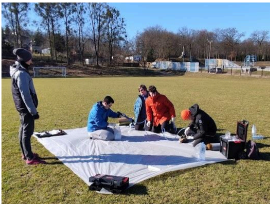
Fig. 3: Launchpad setup.