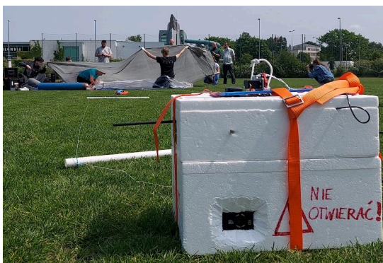
Fig. 4: Gondola made out of Eurobox-style Styrofoam boxes; rigging and launchpad visible in the background.