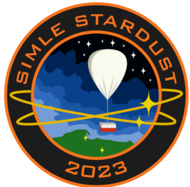
Fig. 1: Mission path of the SimLE Stardust NEXT Project.

After the completion of the Stardust BEXUS Project, many senior team members graduated and moved on, prompting us to recruit new members to continue our work. Fortunately, our project gained recognition and attracted many first-year university students. We decided to divide our efforts into two specialised teams: SimLE Science, focusing on scientific experiments like STORM and AMBER [2], and SimLE Stardust NEXT, dedicated to the technical development of the stratospheric balloon platform.