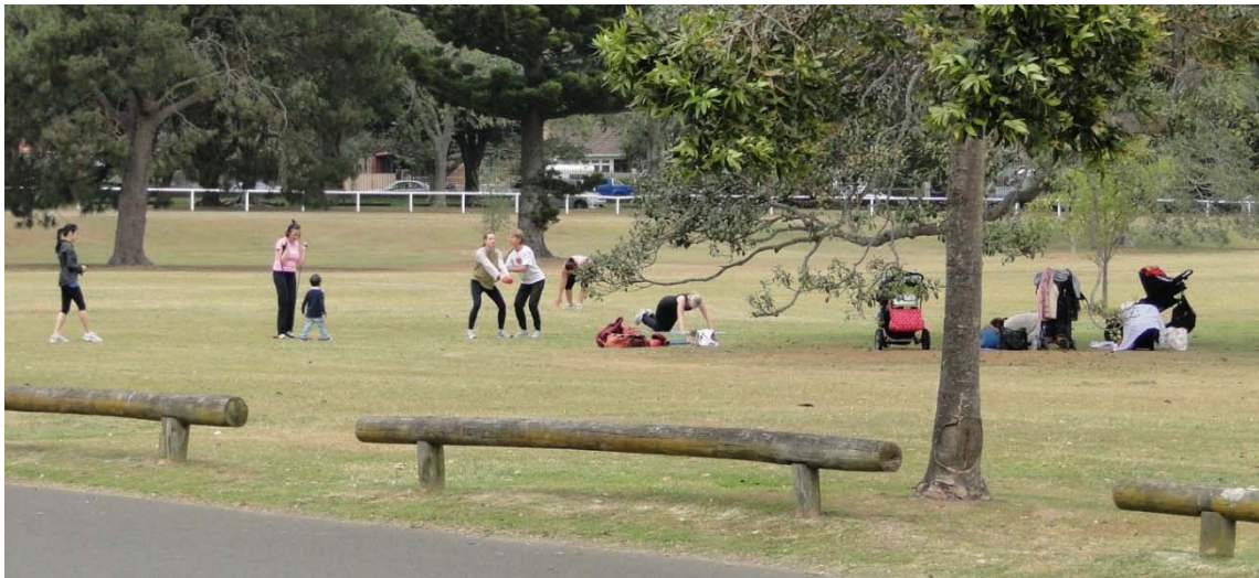
Figure 3. Sydney, Centennial Park. Mothers’ exercise group

to home – which are issues of a more organizational nature, not connected with the spatial aspects of physical activity. An example of well-organized activities in public spaces can again be found in Australia, where the so-called “mothers’ groups” – local groups of women from the same community or neighbourhood, mothers of babies and toddlers – meet for joint exercises (Figure 3). Activities are held in public parks, information can be found on the internet. Trees and the surrounding silence create favourable conditions for sleeping and playing children, while their mothers exercise together and take turns looking after them.