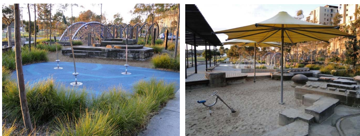
Figure 2. Sydney, Pyrmont. Physically activating public spaces for young and older

Examples of friendly, integrating, and activating public spaces can be found in Sydney (Figure 2). Their significant feature is that they allow the users to enter into the landscape, and even be its integral part. The design of playgrounds and activity spaces is treated as the art of landscaping, which takes into account all natural values: terrain morphology, local building materials and plant species, and local history. Such places have no clear boundaries and they seamlessly fit into the environment. They contribute to the strengthening of spatial order. Equipped with small architecture elements, seats, water facilities, play and sports areas, as well as places to relax and to be active, these spaces are friendly both to very young and adult users, also in terms of undertaking physical exercises.