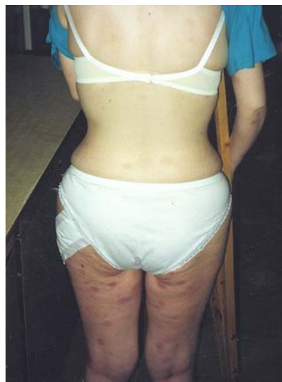
Fig.5. The patient with Ni sensitiveness after applying hip prothesis

The patient (3) with Ni allergy suffered from skin imperfections after introducing hip implant (Fig.5). The symptoms decreased after applying antihistaminic drugs.