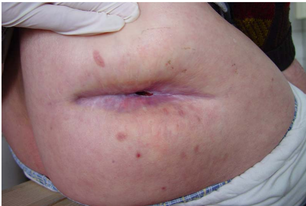
Fig.6. The fistula serosa in hip after implantation

The patients (5,6) whose bones were joint with ZESPOL method, positive reaction to Cr and Ni was found. It appeared as contact dermatitis covering a large area of the skin, not only in the implant-tissue area (Fig.7). Some disturbances in the bone growth was observed. Treatment with antyallegic drugs was ineffective. After 4 weeks the implants were removed and the patients were treated in cast.