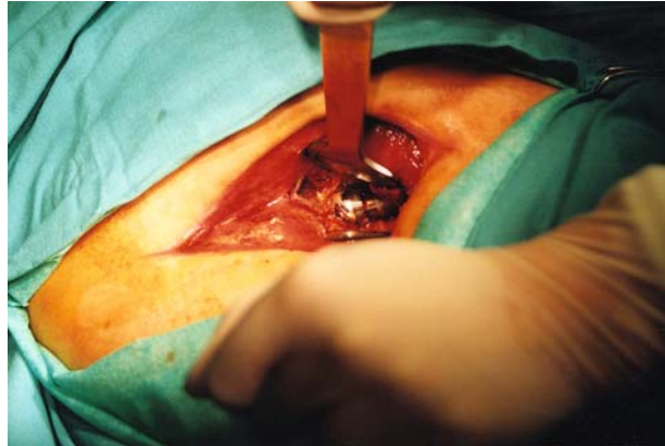
Fig.4. The hip implant removing caused by aseptic loosening

Two of them (1,2) had their implants removed due to aseptic loosening and intolerance of endoprosthesis. It resulted in pain, fistula serosa and edema. There were found to have oversensitiveness to Cr and Co. The allergic were not diminished by using antihistaminic drugs (Fig.4).