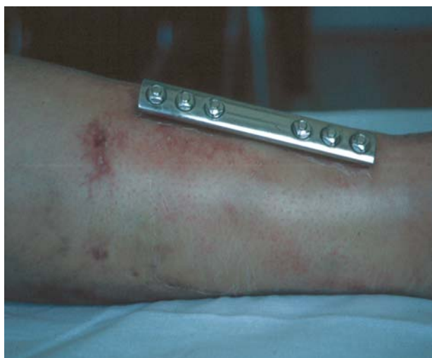
Fig.7. The contact dermatitis on the skin surface

The patients (5,6) whose bones were joint with ZESPOL method, positive reaction to Cr and Ni was found. It appeared as contact dermatitis covering a large area of the skin, not only in the implant-tissue area (Fig.7). Some disturbances in the bone growth was observed. Treatment with antyallegic drugs was ineffective. After 4 weeks the implants were removed and the patients were treated in cast.