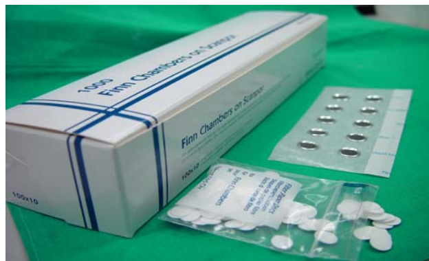
Fig.1. The patch tests were used for the research

The patch tests (Fig.1) were used for the research, which was carried on 6 selected patients, before and after surgical intervention.