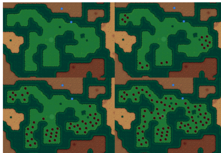
Fig. 2: Graphical representation of the food availability.