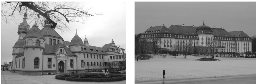
Figure 1. Historic architecture of the city, illustrated by public utility buildings: the balneological centre (left) and the Grand Hotel (right)

The identity of a city and its image is not always permanent and unchanging in time. In the case of Sopot, only 5% of the existing buildings were damaged during the Second World War. However, the most important ones, characteristic for the city and located in its representative part, i.e. in the so-called Lower Sopot, the district which stretches along the beach, were destroyed. The Spa House together with the casino, as well as the two representative hotels – the Metropol and the Wenninghof were burnt down. Sopot was a seaside spa and was visited by guests who, apart from taking baths and enjoying different treatments, were also gambling. The reputation of the casino went far beyond the city boundaries; there were stories about lost fortunes and suicides committed by the profligates in the depths of the Bay of Gdansk. Despite the war destruction, some of the public utilities, such as the balneological centre, the Grand Hotel and the pier, have survived in the seaside part of the city. All of them are still functioning today and constitute important landmarks in the city space (figure 1, 2).