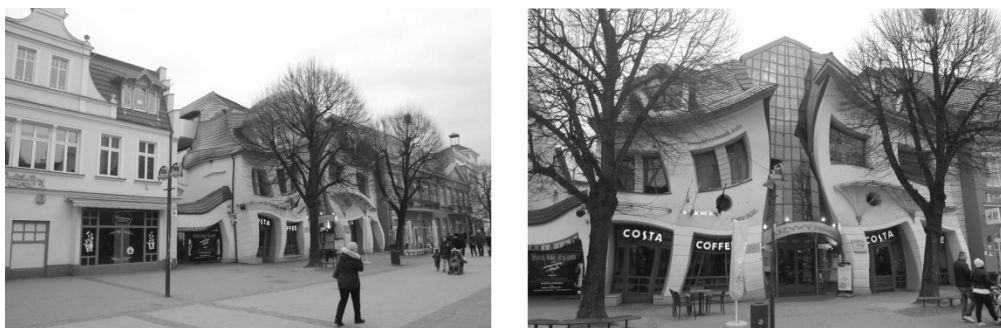
Figure 6. Today's architectural symbol of the city – an architectural joke, the so-called Crooked House in the street frontage

The so-called Crooked House is a characteristic building, constructed in 2004 and located in the frontage of Bohaterow Monte Cassino street - the main pedestrian precinct. The inspiration for this project were the works of a famous Polish artist – Jan Marcin Szancer, who was an illustrator of books for children [6]. Szancer's illustrations are magical, full of mystery and romanticism. The Crooked House does not possess any of these features – it is solely an architectural joke – despite the fact that it was constructed with the use of good-quality materials and has a certain charm. It should be located in an amusement park and not in the main street of a seaside spa with established identity, connected with the heritage of historic architecture from the turn of the 20th century. Like in the case of the Haffner Centre, the Crooked House may contribute to lowering the rank of Sopot – a cosy spa with unique character, which is currently being transformed into a popular, colourful and noisy place, similar to many others which can be found on the coast (figure 6).