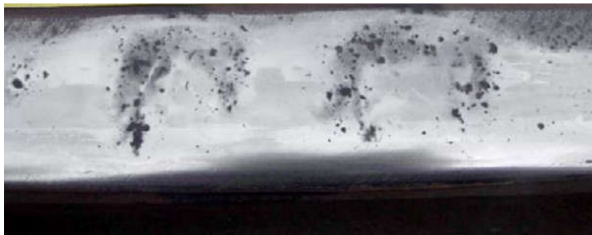
Fig. 2. Typical forms of squat-type defects: V-shaped crack (left) and arc-shaped crack (right).

Squat-type defect develop at the running surface of the rail in the region of the contact between the rail and the wheel. Squat-type defect has the form of a darker localized depression containing cracks with semi-circular arc or V-shape (Fig. 2). Squat can be located randomly as a single or multiple defects, and it is usually detected in the rail joints (in that case squat is classified as the defect due to the process of rail joining) [1].