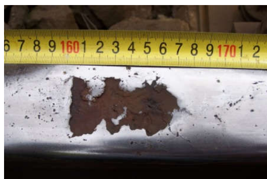
Fig. 3. Measurement of defects.

We performed the measurements of the squat-type defects in rails of the running train line. We measured the parameters such as the length of depression, length of defect, the depth of depression and the depth of defect (Fig. 3).