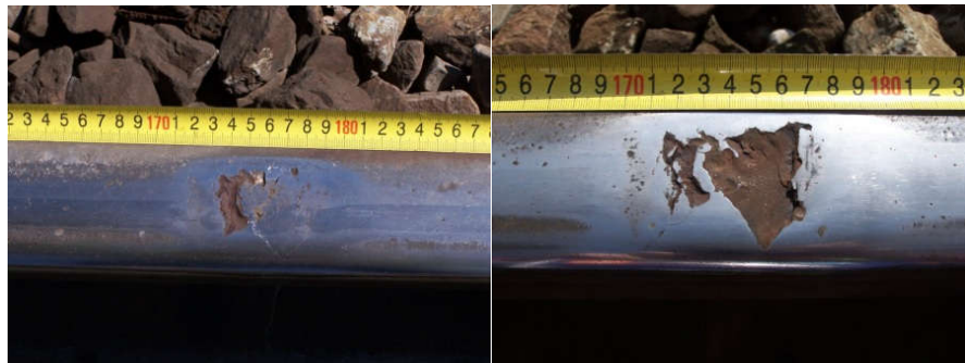
Fig. 4. Development of defect in the rail over a period of 15 months of rail exploitation.

From practical point of view it is important to automatize the measurements and to assess the dynamics of defect development in rail (Fig. 4) and to use the results for forecasting the maintenance works. This is crucial since the vehicles use the tracks with defected rails, which impacts the safety of passengers and freight.