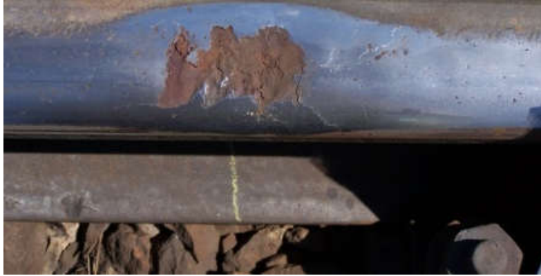
Fig. 1. Squat-type rail defect.

Squat-type defect develop at the running surface of the rail in the region of the contact between the rail and the wheel. Squat-type defect has the form of a darker localized depression containing cracks with semi-circular arc or V-shape (Fig. 2). Squat can be located randomly as a single or multiple defects, and it is usually detected in the rail joints (in that case squat is classified as the defect due to the process of rail joining) [1].