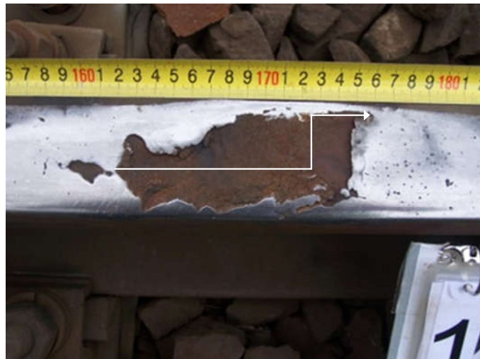
Fig. 7. Defect with a significant length and a significant width.