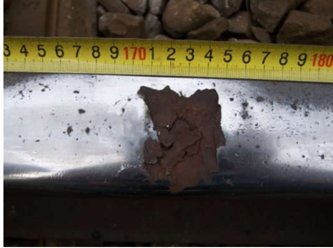
Fig. 6. Defect with a short length and a significant width (the difference between defect length and its diameter \delta(A) )