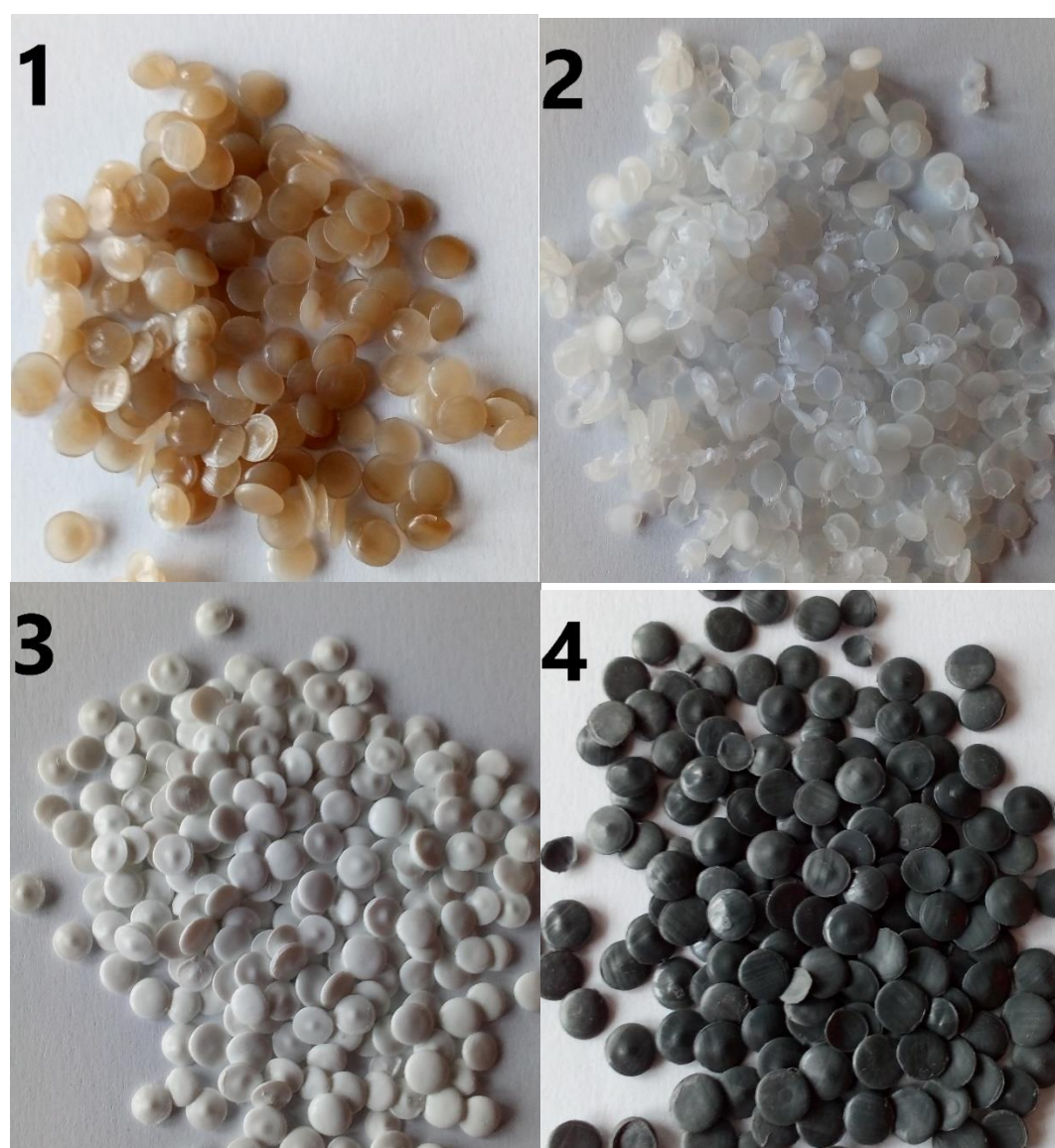
Figure 1. The appearance of analyzed recycled LDPE streams.

investigated and described in the literature. It should be, without any doubt, analyzed during the application of recycled and waste materials, which could be contaminated and partially decomposed as a result of consumer use. Such an effect may noticeably affect the environmental impacts of various materials, e.g., recycled plastics. Therefore, in the presented work, we aimed to assess the VOCs emissions from the recycled low-density polyethylene (LDPE) streams.