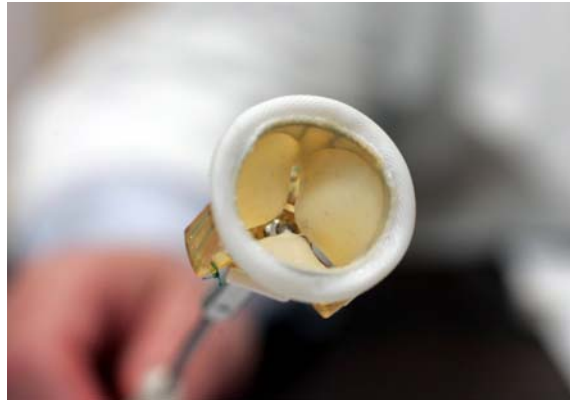
Fig. 4. Biological heart valve of new generation [60]