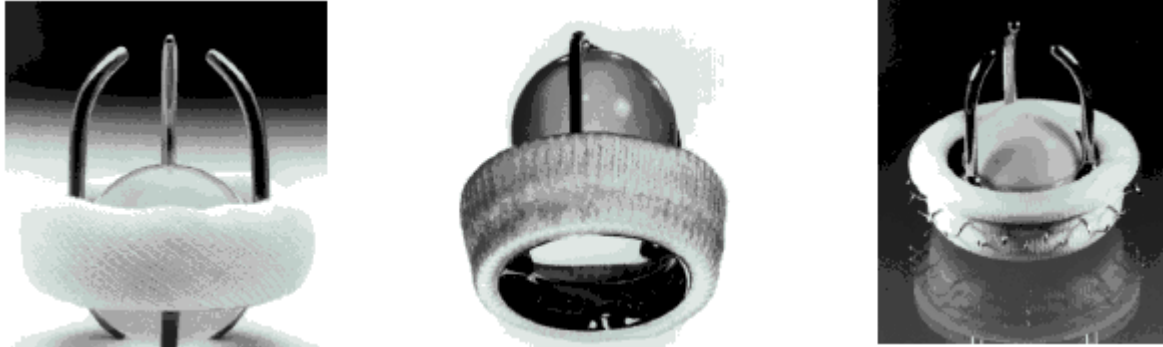
Fig. 2. Mechanical heart valve with ball shape [51]

insufficient biocompatibility cause hemolysis of blood, leading to its coagulation, and consequently require by patients anticoagulation treatment. Despite this, the mechanical valves are often used in cardiac surgery, due to its stability, which reduces the risk of re-operation due to valvular dysfunction.