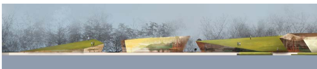
Figure 3: Proposal for the ecological landscape of a Media Institute campus (A. Popławska).

Post-industrial territories appeared to be particularly interesting case studies. There, students focused on concepts that facilitate the process of changing grey into green urban infrastructure, stimulate social life and reclaim biodiversity. To meet these objectives they designed different kinds of rain gardens for natural retention, filtration systems and constructed wetlands for treating rainwater, including floating islands with retrofitted vegetation (see Figure 2).