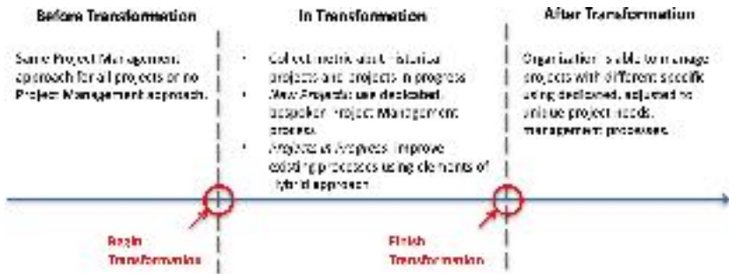
Fig. 1. Agile Transformation Process

Organization which has completed Agile Transformation is ready to implement various projects with different specific using dedicated, bespoke Project Management process. The course of Agile Transformation is summarized in the figure below (Fig. 1).