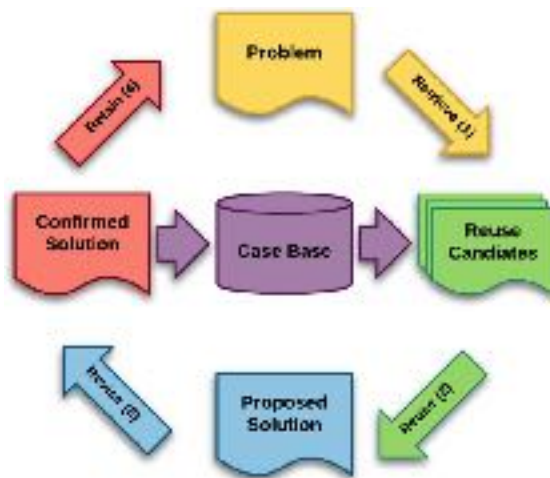
Fig. 3. Case Based Reasoning cycle

At Retrieve Stage CBR system looks for historical cases relevant to target problem which is to be solved. Similar cases are extracted from the system and transferred for further processing. Relevant cases are to some extent similar to target problem: most of their key aspects and parameters are similar to key aspects and parameters of target