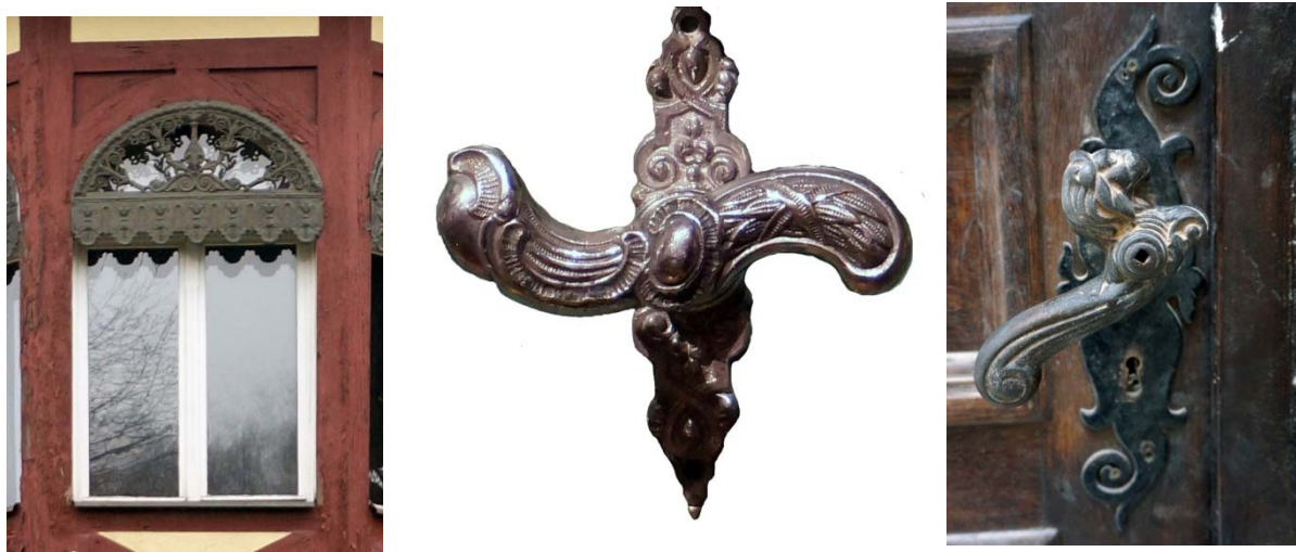
Figure 7. Cast iron elements of the elevation of the building; on the left side: lambrequin in form resembling the fabric; in the middle: window-handle; on the right side: door-handle in a shape of a lion.

2.5.2. With the increase in the level of hygiene in the kitchen began to use cast iron sinks . In the apartments of wealthy people, they began to ringfence the bathroom in which cast iron bathtubs started being in use. The sinks had a semi-circular shape with which a flat plate was attached to protect the wall from moisture. The baths were similar in plan to the rectangle. One of the shorter sides could be semicircular. Semicircularly ended edges made it easy and safe to enter and exit the bath. They stood on four feet sometimes reminiscent of animal feet. For obvious reasons, the interior of the sinks and baths were covered with white enamel. Poor people were still washing themselves in wooden dishpans and tubs or were using public baths. Their access to cast iron sinks and bathtubs was gradually progressing throughout the nineteenth century and beginning of the next century.