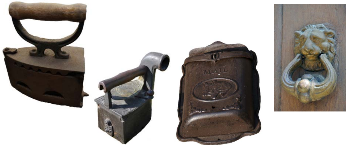
Figure 2. Cast iron irons with holes assuring the inflow of oxygen into the device with burning embers inside. On the left example: semi-circular holes on sides; on the right example: the hole in shape of pipe above the handle and a metal plate protecting hand from high temperature

batch and necessity of its replacement was obtained. Some of the irons had additionally decorative covers and handles.