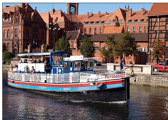
Fig. 6. Historic motor powered ship m/s Bydgoszcz [20]

tions adopted in Bydgoszcz, Gdansk and Krakow were placed in the table in condemning whether the factor is closer to the solution adopted in the transport and tourist transport. The data from the analysis are summarized in Table 2.