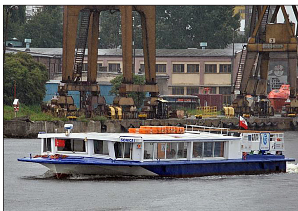
Fig. 5. Sonic I during a course on line F5 [14]