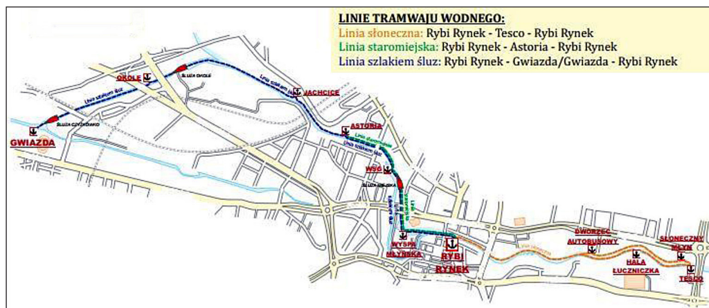
Fig. 3. Water tram line diagram in Bydgoszcz, along with stops [12]