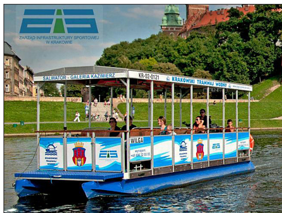
Fig. 8. Krakow water tram [22]