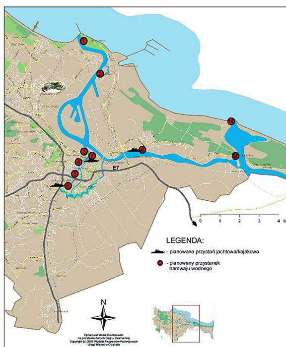
Fig. 1. Deployment of the PODWwG infrastructure [4]