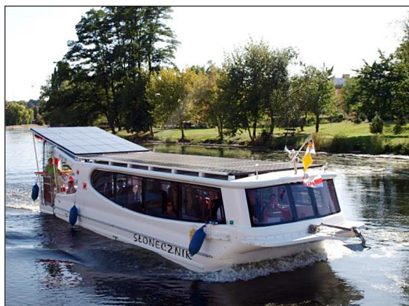
Fig. 7. Two solar-powered ships “Słonecznik” and “Słonecznik II” [21]