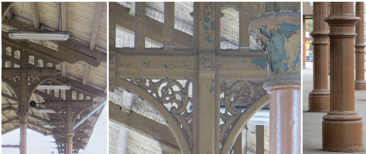
Fig. 2. Gdańsk Główny railway station, platform No. 2 roofing, 2012

Il. 2. Gdańsk Główny, dworzec PKP, zadaszenie peronu 2, stan z 2012 r.