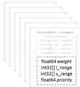
Fig. 2. Fields of SOEKS that allow them to participate in the processes of similarity, uncertainty, impreciseness, or incompleteness measures.

cisness, or incompleteness measures to facilitate the indexing and retrieval purposes. These fields are: weight, priority, lower range and upper range [33], as shown in Fig 2.