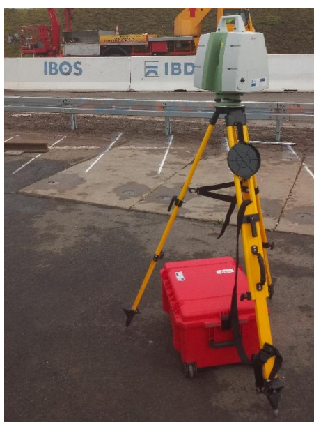
Fig. 1 Leica C10 laser scanner, placed on the tripod.

In Architectural Inventory the most commonly used is terrestrial laser scanning. It is represented by a scanner mount on a tripod.