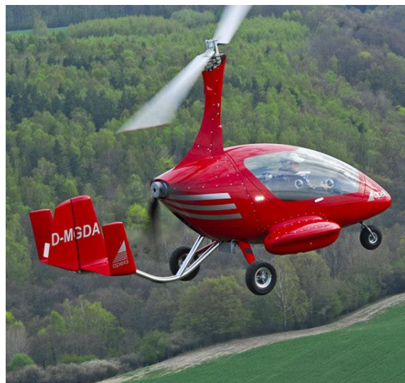
Fig. 4 Gyroplane, which is used for mapping using Airborne Laser Scanning