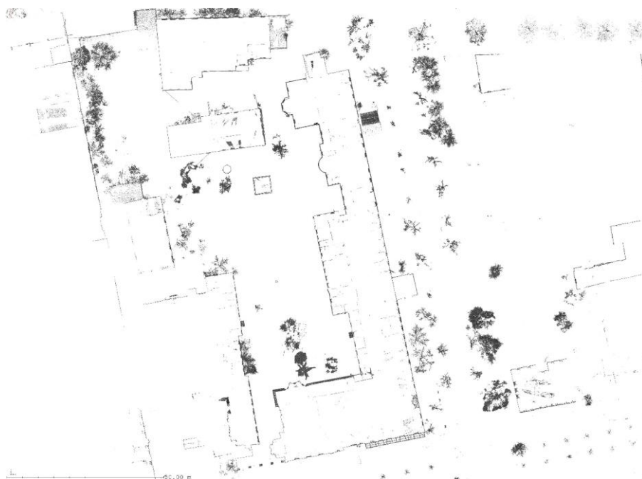
Fig. 6 the complex of Blessed Virgin Mary hospital.