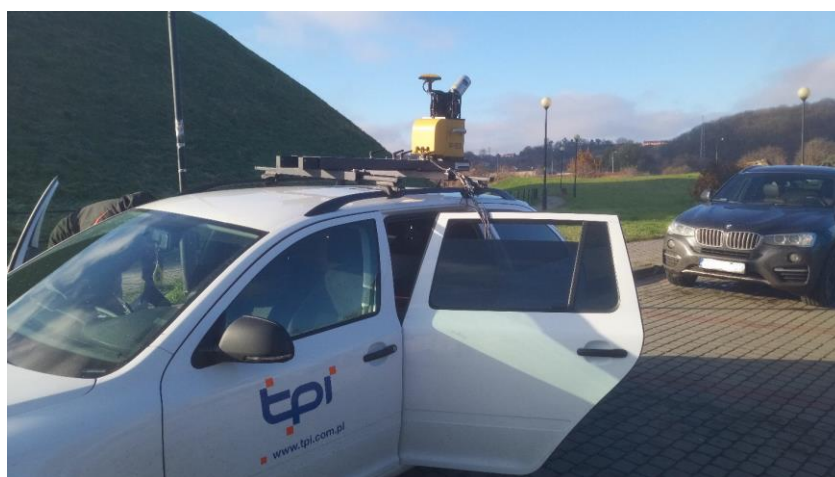
Fig. 2 Mobile laser scanner (Topcon, IP-53)

In architectural inventory, Mobile laser scanning (MLS) has its usefulness when the project requires spatial information about complex of buildings with the high accuracy of the data and where the user is able to save a lot of time in comparison with measuring the whole structure by using the terrestrial laser scanning. Mobile scanner bases its operation on the trajectory. It is referred to as the path of the object's motion in a function of time and it is the starting material for the integrated system of IMU / GNSS (Inertial Measurement Unit / Navigate Global Satellite System), also called as INS (Inertial Navigation System). INS determines speed, position and angle orientation of the unit. Angle orientation is determined by the three- axes gyroscopes and accelerometers described as the values of the angles: roll (transverse swinging), pitch (longitudinal swinging) and yaw (angle, corresponding to the device descent of the course). To set an approximate position of the scanner the GNSS unit is used and it refers to information about XYZ coordinates of the scanner. They are important for the correct execution of coordinate transformations registered by the scanner into the coordinates recorded by the GNSS receiver. In order to transform the coordinates correctly, it is required to measure the distance between the point 0.0 of the receiver (the phase center) and point 0.0 of the scanner (the origin of the scanner) (Janowski et al., 2015).