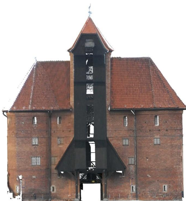
Fig. 5 The front elevation of the crane in Motlata river, Gdansk

Most of the projects that have been ordered are very challenging. Besides the final product the technological aspects of the technology are difficult to understand and with such complex projects as architectural inventories there could be a need to create an expertise to validate the collected data. Besides these tasks, there is a need to educate people about this field of measurements to create base of potential clients which are aware of advantages of using innovative measuring technology. The one of the example of the project, which has been accomplished, was creating documentation about the Crane in Motlawa River, in Gdansk, Poland which is listed by the conservation office. The object was very complex and it took more than two hundred scanner positions to acquire detail information about the whole building. Number of scan stations depended on many details inside the structure and narrow passages obstructing the laser swath. Combined point cloud, showed that besides the fact, that Crane was rebuilt after the Second World War, the walls were not straight. Based on that assumption, the quality of acquired model was doubted and it was essential to get independent expertize. The evaluation of the post-processed data based on checking the correctness of the created model. The expertise was made where the standard deviation of the whole model was calculated.