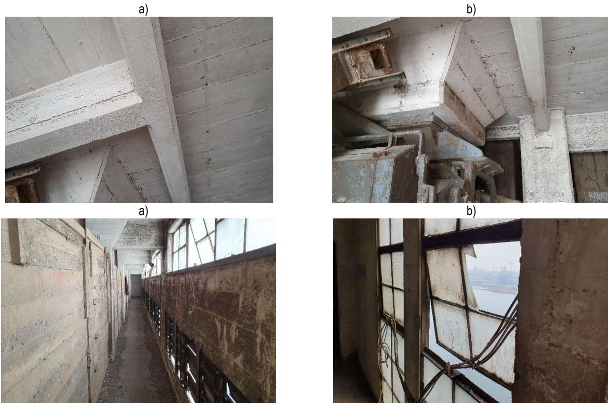
Photo 5: Grain Elevator building - level +5: a) mechanical damage to structural elements, b) equipment for transporting loose materials left inoperative and incomplete, decapitalization of: c) ventilation shutters, d) window joinery