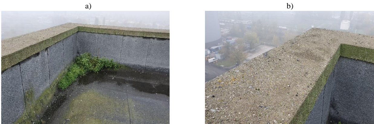
Photo. 2: Grain Elevator building - roof level: decapitalization of: a) roofing felt (blistering and unevenness), b) cornice elements (carbonation)