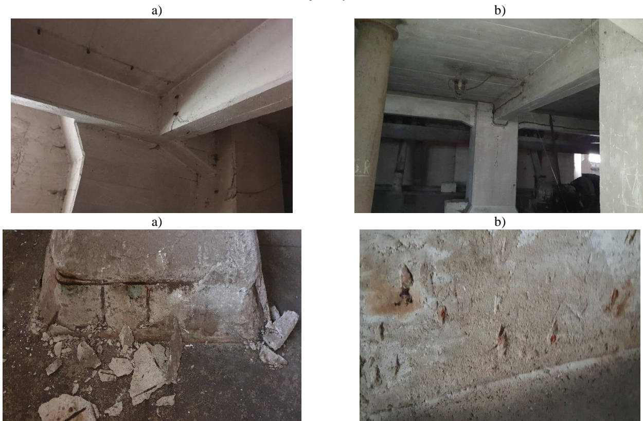
Photo 6: Grain Elevator building - level -1: a) mechanical damage to structural elements, floor zone: c) concrete cover falls off the column heads at the level of the foundation slab, d) moisture in the outer wall