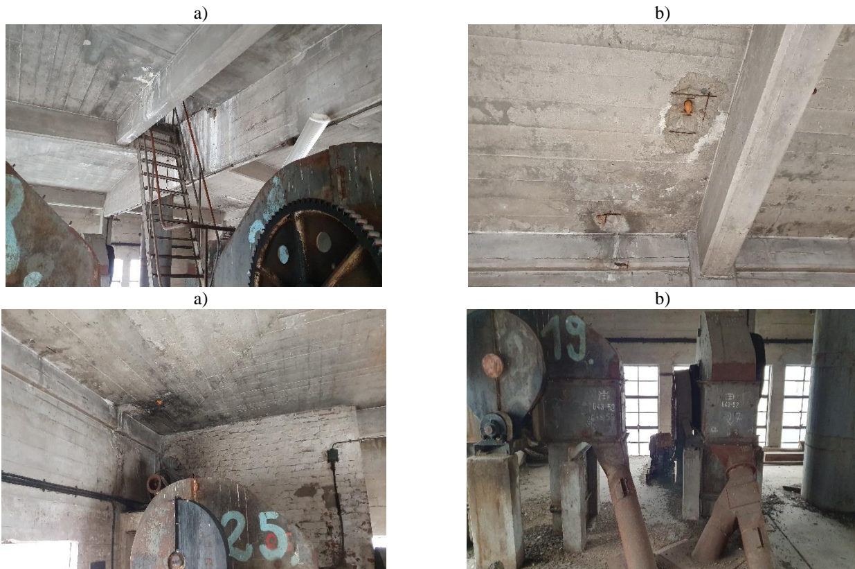
Photo 3: Grain Elevator building - level +10: a) mechanical damage to structural elements, b) defective and incomplete equipment for transporting loose materials