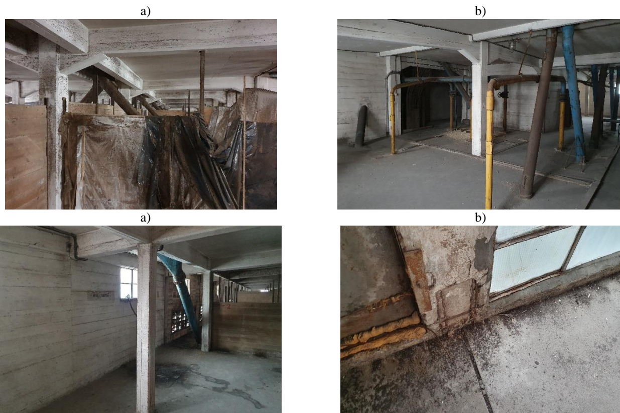
Photo 4: Grain Elevator building - level +7: a), b), c) division of the usable area with wooden partitions, d) falling off the concrete cover in the floor zone