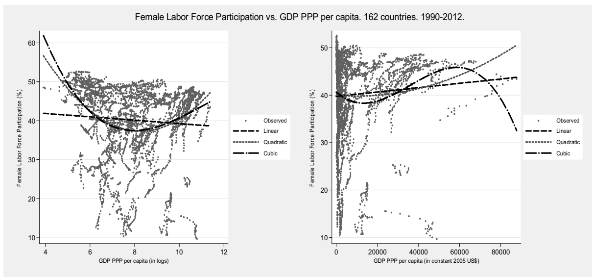
Chart 1. Female Labor Force versus GDP per capita. 162 countries. Period 1990-2012.

bor market remains significantly low, regardless of high GDP per capita. It leads to the general conclusion that changes in female labor force participation are not exclusively attributed by economic growth, but depend on a multitude of factors which are not captured in here.