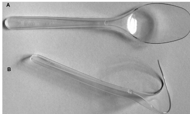
Fig. 1. Appearance of a disposable transparent teaspoon made of polystyrene (A) before and (B) after being used to mix a hot beverage.

For the analysis of the emissions of monoaromatic hydrocarbons, nine different disposable plastic utensils were purchased from a local wholesaler. The utensils were collected directly from a new batch of 100 lots packed in closed PE bags. For each sample, 10 random products were selected from a batch and covered with aluminium foil before laboratory analysis. These materials were (i) white PS cups for hot beverages (KB_PS), average mass of (0.6934 \pm 0.0045) g; (ii) transparent PS teaspoons (LAB_PS), average mass of (1.429 \pm 0.047) g; (iii) black PS lids for takeaway coffee cup (LID_PS), average mass of (3.074 \pm 0.095) g; (iv) black PP straws for hot and cold beverages (SL_BC), average mass of (1.500 \pm 0.074) g; (v) white PS knives (SZT_WH), average mass of (2.249 \pm 0.081) g; (vi) transparent PS forks (SZT_BB), average mass of (4.313 \pm 0.041) g; (vii) cups made from paper plastic laminates (PPL) consisting of high-quality cellulose fibre with a thin internal PE coating (KB_CEL_PE), average mass of (3.43 \pm 0.13) g; (viii) black PP