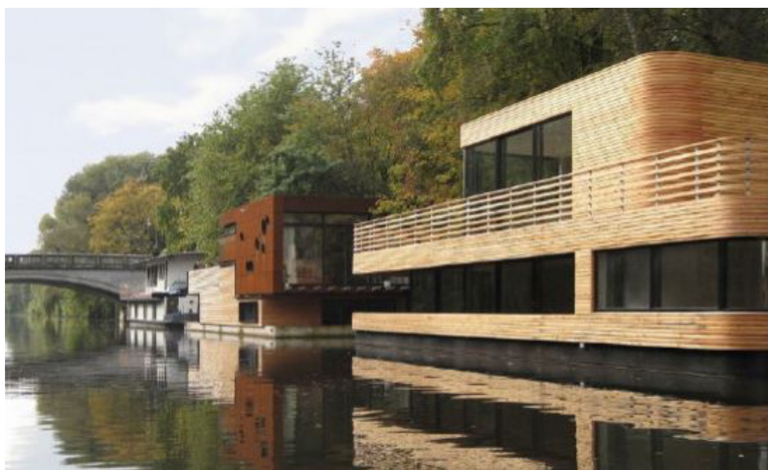
Figure 3. Floating House in Eibekkanaal, Hamurg, Germany [17]