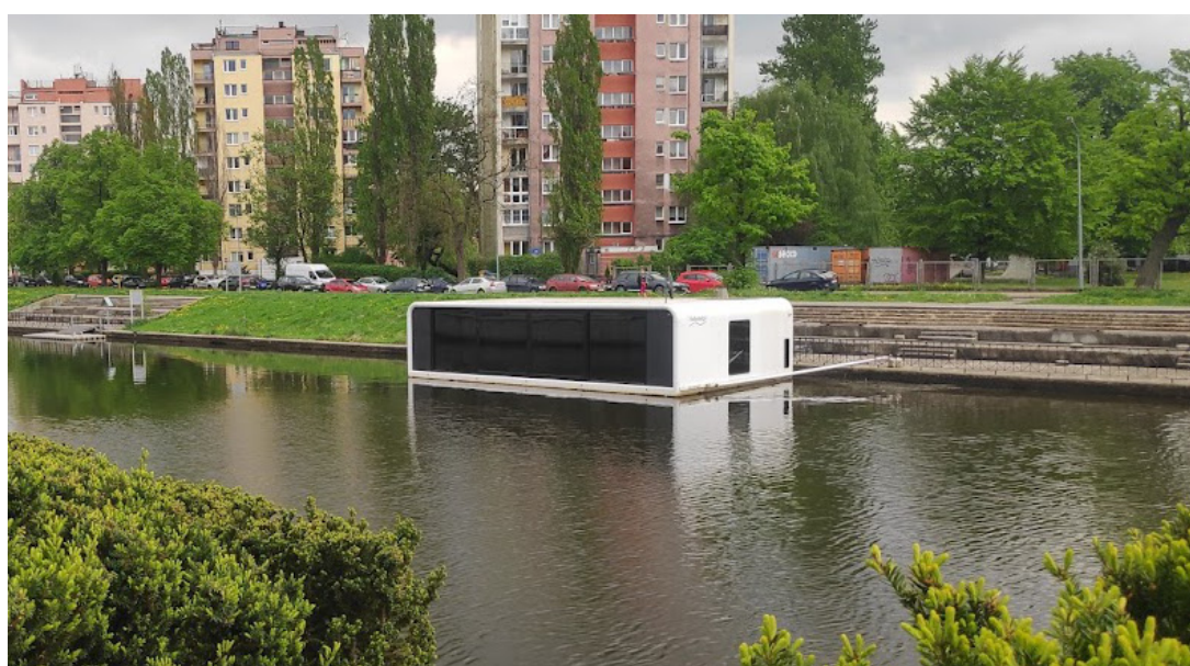
Figure 4. Floating house located in the center of Gdańsk, Poland [18]