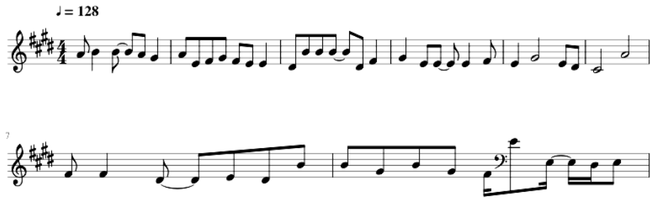
Fig. 4. Highest rated melody generated using Music Composer