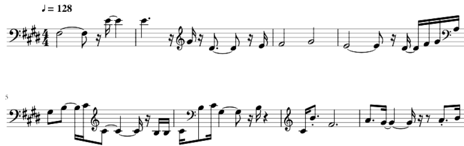
Fig. 5. Lowest rated melody generated using Music Composer