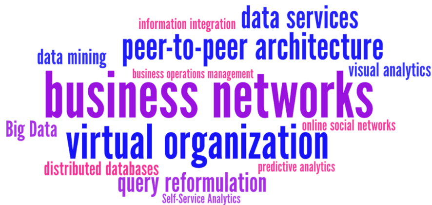
Figure 2. Foundational Ontology for the Collaborative Business Intelligence.

this architecture differs from a traditional BI system in two aspects. First, it is based on the integration of heterogeneous semantic concepts to build upper ontologies comprising general terms that are common across all domains. Second, source data retrieval in terms of low coupling and abstraction is achieved by following Service Oriented Architecture (SOA) procedures.