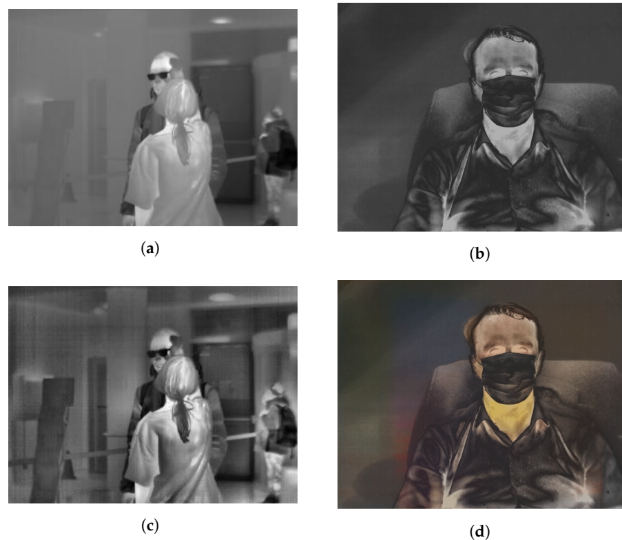
Figure 2. Example of three types of preprocessing: (a,b) images with normalized range of raw data, (c) image is image (a) after changing contrast using CLAHE and (d) image is image (b) after colorization.