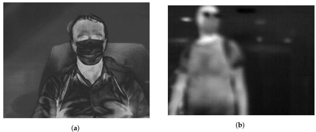
Figure 1. Examples of two types of images included in dataset: (a) good quality image and (b) poor quality image.