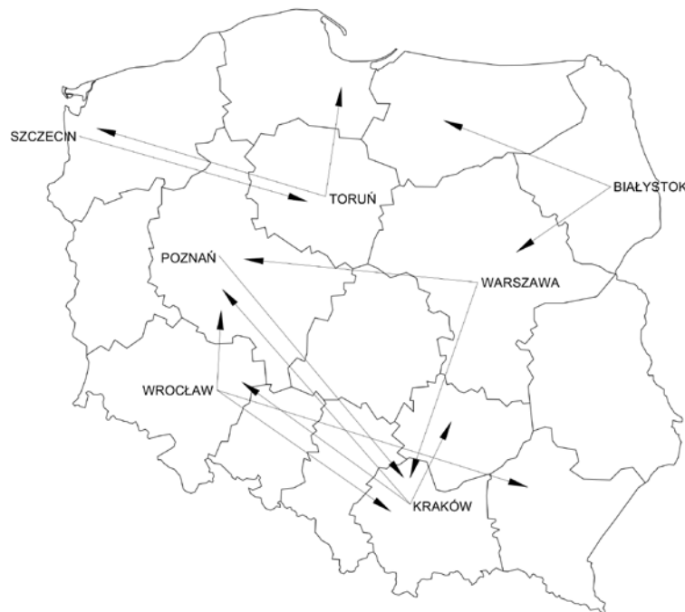
Figure 2: Map of Poland showing students' mistakes in the location of major cities (Source: Authors).

Fifty-seven students took the retake examination, 34 of whom sat for the examination in the primary examination period. The pass rate for the task of recognising structures from pictures was 38.60%. This was 44.12% among students who were retaking the examination, and 30.43% among students who did not take the examination in the primary period.