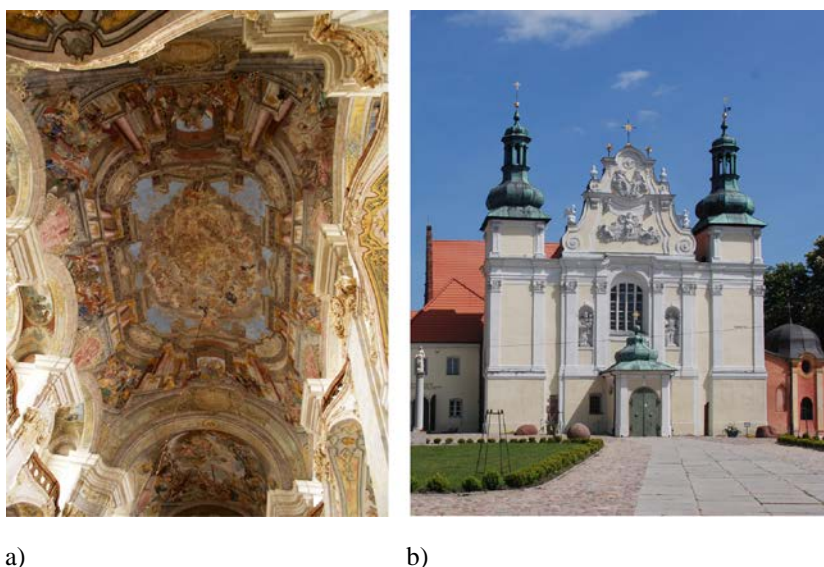
Figure 3: Sample illustrations from the examination; a) vaults of the Jesuit Church in Brzeg; and b) façade of the Norbertine Church in Strzelno (Source: Department of History, Theory of Architecture and Conservation of the FA-GUT).

A comparison of the results from the basic and retake examination shows that the extra time allowed the students to achieve only slightly better results. The pass rate of the retake examination was much lower, and the number of correct answers was higher where students can rely on intuition (function and style), and lower that require specific knowledge from lectures. The pass rate was also higher among those who sat the first examination, but did not pass than those who took only the retake examination.