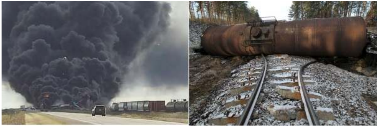
1. Railway disasters: a) in the Canadian province of Saskatchewan on 7/10/2014; b) in Wydmyny on 2 January 2016.