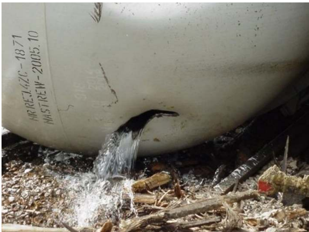
2. The negative impact of the railway disaster on the track. The catastrophe in Szczygłowie 05/23/2002 [10]

Collisions and derailments should also be looked at as follows: What if there were dangerous goods on the train?