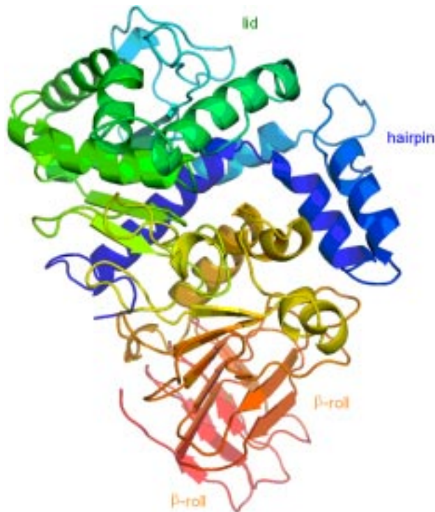
Fig. 2. Model of Lip1 lipase (the successive fragments of the molecule with defined secondary structure are marked in different colors: dark blue from the N-terminus and red at the C-terminus; the domains formed by these fragments are also shown in the model).

is characterized by a lack of 138 amino acids in the polypeptide chain. The evidence that the lack of a fragment of the polypeptide chain is possible was provided by an earlier experiment of Jiang et al. (2006) who isolated from the non-culturable bacterium Pseudomonas the gene of the homologous enzyme (by using the genome-walking approach), expressed it in the yeast Pichia pastoris and obtained the biologically active protein. This means that the lacking structural element in lipase Lip1 and lipase LipJ03 from non-culturable Pseudomonas strain is not characteristic of all lipases belonging to family I.3 and it is not essential for retaining their activity.