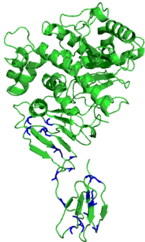
Fig. 3. The model structure of Lip1 lipase (clusters of Gly residues in C-terminal domain are marked in dark blue).

The active site of lipases is defined by a canonical catalytic triad, which in Lip1 consists of Ser 207 , Asp 255 ,