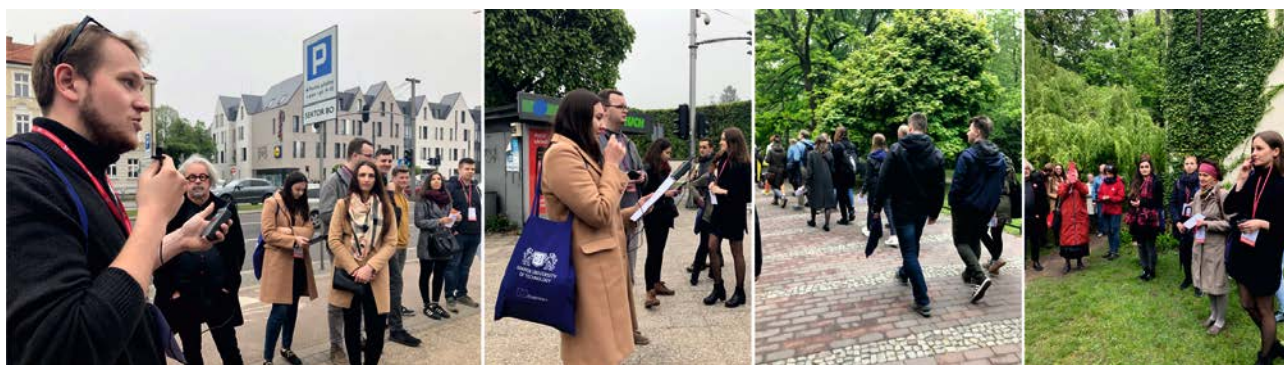
Figure 3: Student preparatory, participatory workshop Jane's Walk/Market Walk within the participatory planning course, for Master students, GUT, May 2019 (Photographs by J. Borucka).

For the students, it also created a solid theoretical and practical base for the participatory design activities [22][23].