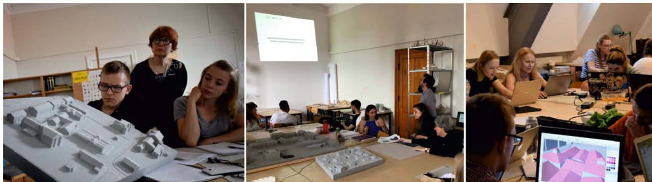
Figure 4: Student participatory, design workshop within the optional seminar Marketplaces/Social Spaces , for Master students, GUT, June 2019 (Photographs by J. Borucka and A. Benedetti).

The course was organised in the form of a block (one-week) seminar and workshop. It concerned the preparation and implementation of creative concepts in public spaces (urban solutions and architectural interventions) related to the issue. It was planned as interdisciplinary group work. Around 30 students were divided into small groups, each working on creative solutions for the Polanki marketplace in Gdańsk-Oliwa (Figure 4).