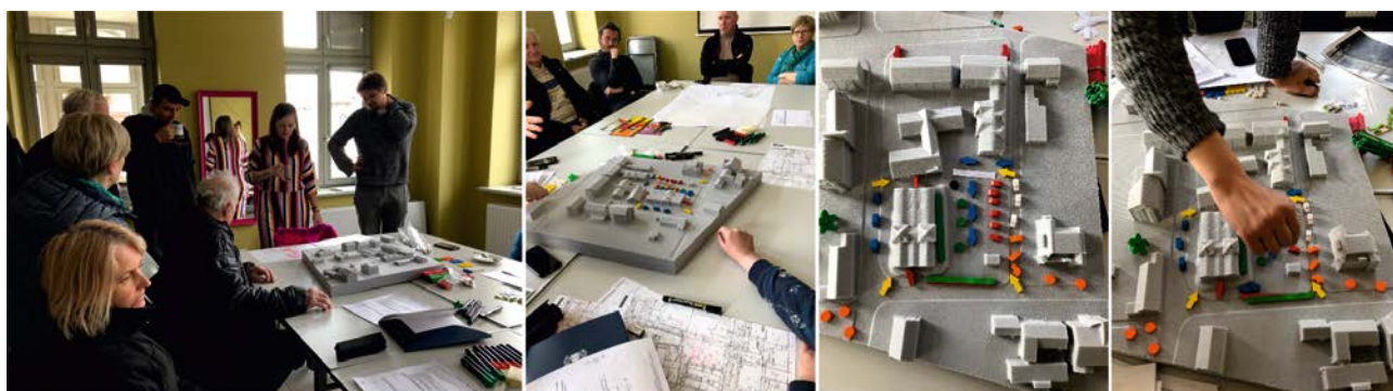
Figure 2: Professional participatory workshops in physical design, GOSPOSTRATEG project, April 2019 (Photographs by J. Borucka).