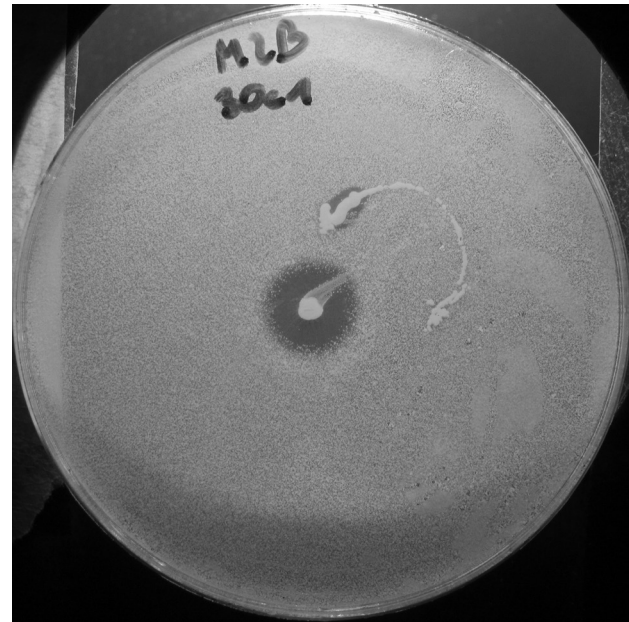
Fig. 1. Growth inhibition zone around the colony of producer strain M2B; an indicator strain – S. aureus 30C1.

Conditions for the effective production of the putative bacteriocin by S. xylosus M2B in a liquid culture were optimized in the terms of medium type, time period and incubation temperature. Comparison of