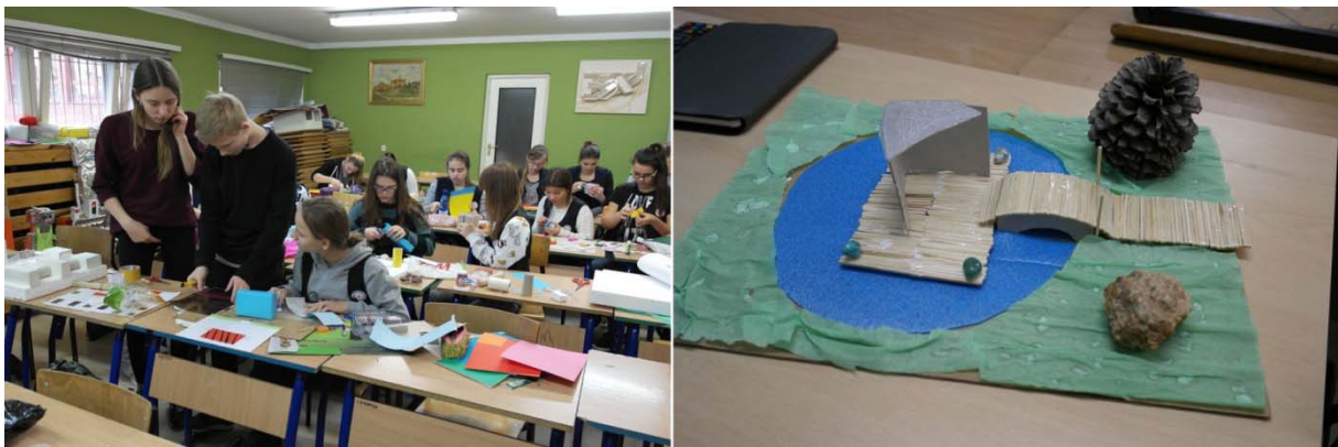
Fig. 2. Space shaping class, form 3A, Lower Secondary School in Malbork 7 (E. Marczak)