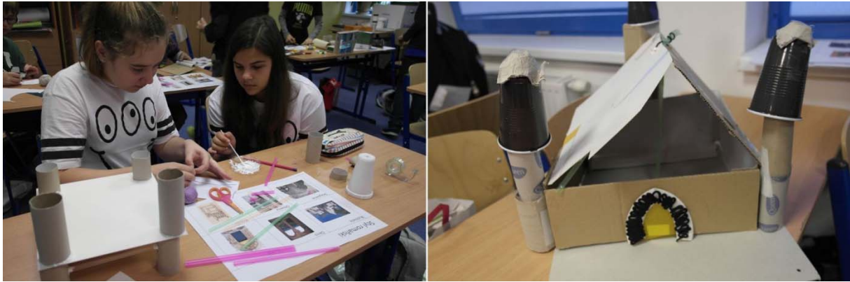
Fig. 1. Architectural styles workshops conducted as part of history and art classes in the 4 th form, Primary School 12, Gdańsk