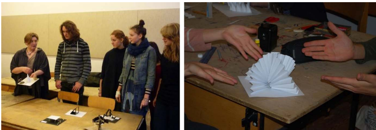
Fig. 3. A class for a form specializing in mathematics and architecture in Gdańsk Autonomous High School 8 (E. Marczak).