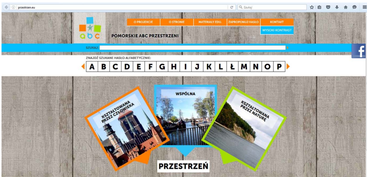
Fig. 6. The main page of the platform www.przestrzen.eu (by J. Porańska).