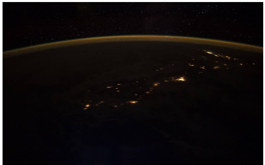
Figure 4. Night-time view of New Zealand taken from the International Space Station on 23rd October 2017, showing how much dark country exists; the only bright areas of illumination are coming from urban areas and other human settlements.

According to information provided by Stats NZ Tatauranga Aotearoa, which is the country's government public service department responsible for the collection of statistics, light pollution levels in 2014 were estimated as low (Figure 4). Additionally, “... based on land area, 74 percent of the North Island and 93 percent of the South Island had night skies that were either pristine or degraded only near the horizon” [9].