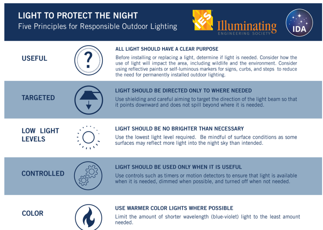
Figure 6. Five Principles of Responsible Outdoor Lighting. Source: International Dark-Sky Association [139].

In order to become a Dark Sky Nation, New Zealand should create national light pollution law, which could be based on other countries' efforts, such as France [135], Great Britain [136], or Slovenia [137], as this would protect the natural environment and citizens' rights against the abuse by other people or companies, etc. This general law could then be supplemented by local lighting ordinances already in place, or be based on the IDA/IES Model Lighting Ordinance [138].