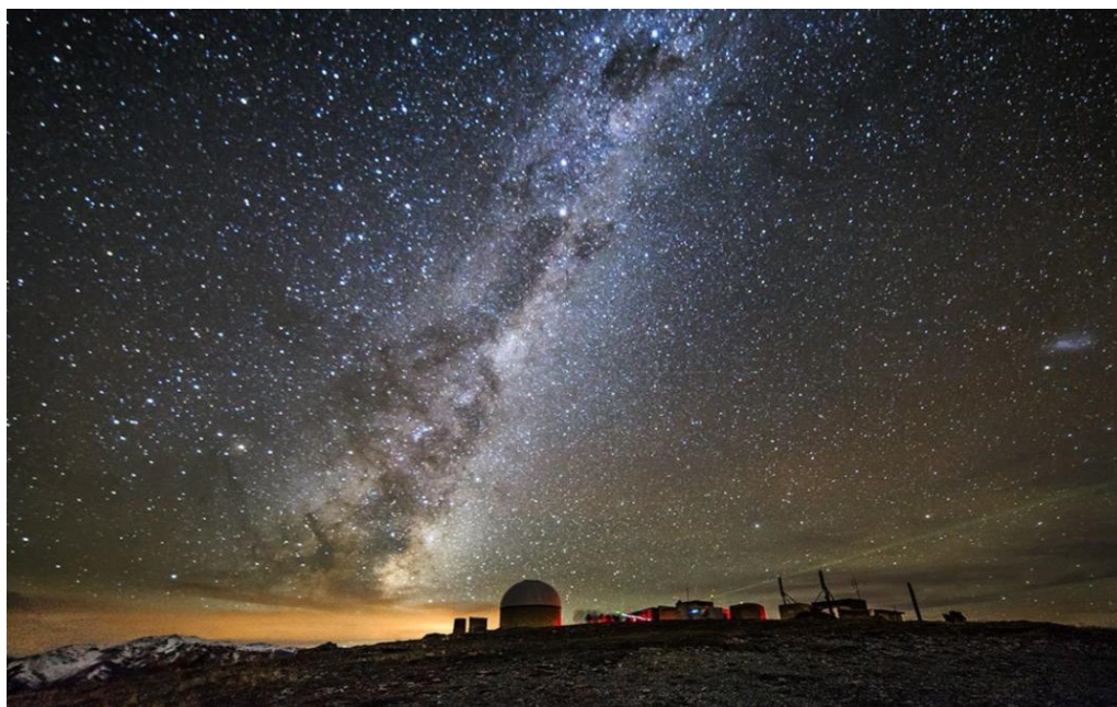
Figure 1. Mt. John Observatory, located within the Aoraki Mackenzie International Dark Sky Reserve (AMIDSR) in New Zealand, including part of the Crux (also known as Southern Cross, visible above the coal sack nebula). The Crux constellation can be seen throughout the year in the Antipodes in a bright part of the Milky Way.

Parks, (3) International Dark-Sky Reserves; (4) International Dark-Sky Sanctuaries and (5) Urban Night-Sky Places.