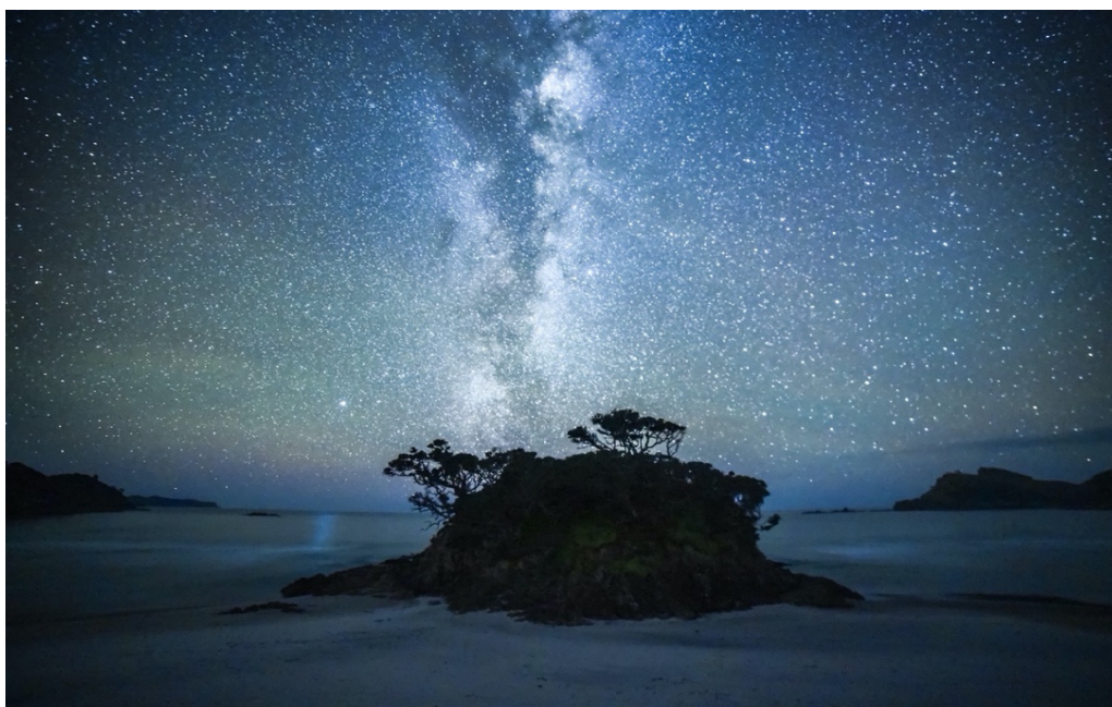
Figure 2. Aotea/Great Barrier Island, New Zealand's first Dark Sky Sanctuary. Great Barrier has no streetlights and all power is self-generated.