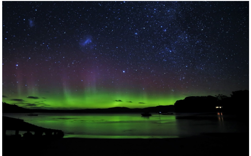
Figure 3. The Aurora australis as seen on Rakiura/Stewart Island—an IDA recognised Dark Sky Sanctuary. (Rakiura means glowing skies in Māori.) New Zealand has two dark sky sanctuaries (both of which are islands) out of ten sanctuaries that exist worldwide.

According to information provided by Stats NZ Tatauranga Aotearoa, which is the country's government public service department responsible for the collection of statistics, light pollution levels in 2014 were estimated as low (Figure 4). Additionally, “... based on land area, 74 percent of the North Island and 93 percent of the South Island had night skies that were either pristine or degraded only near the horizon” [9].