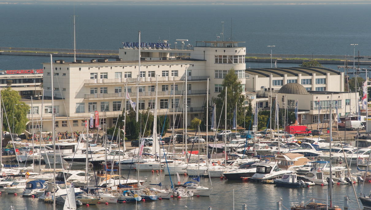
Fig. 2: Gdynia Maritime Academy on the South Pier (built 1938-1939), 2017

The first manifestations of Modernism appeared in the late 1920s and the 1930s, in relation to the operation of the port, and were located next to the wharfs and on the piers, next to such port infrastructure as various stevedoring facilities. Many constructions were erected, in which numerous foreign and domestic maritime trade companies invested. These constructions included port administration buildings, customs services facilities, office space and a large number of structures for food processing, and storage of goods – cold stores and silos. 6 Since the decisive factor in designing these buildings was their function and economic efficiency, practically all of them were given modernist forms, frequently as a simple reinforced concrete structures with the commonly applied red brickwork. (Fig. 3)