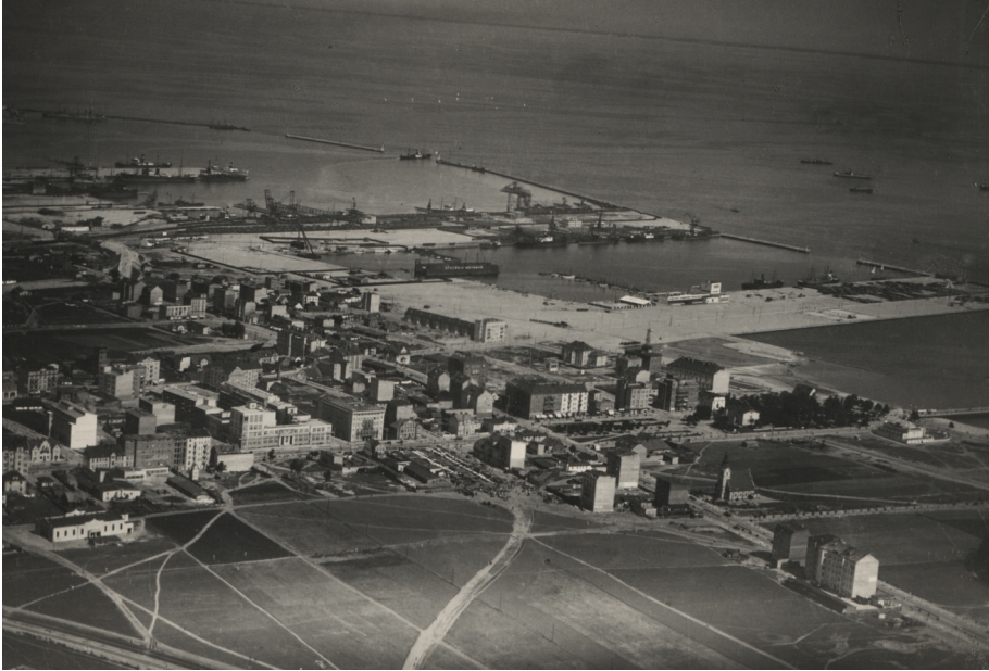
Fig. 1: View of the city and the port, 1933

the first design draft were prepared by engineer Tadeusz Wenda, who was also responsible for subsequent stages of design, and a special act was passed by the Parliament of Poland in 1922.