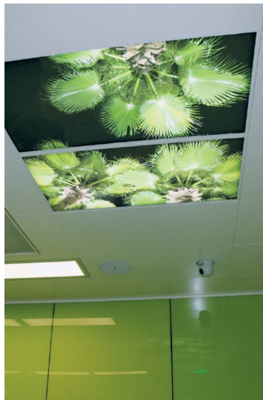
Figure 6. The ceiling art above hospital patient bed, 2016

use), non-porosity and the jointless connection. For the sake of its elasticity at forming shapes it is also used to make worktops and wash basins.