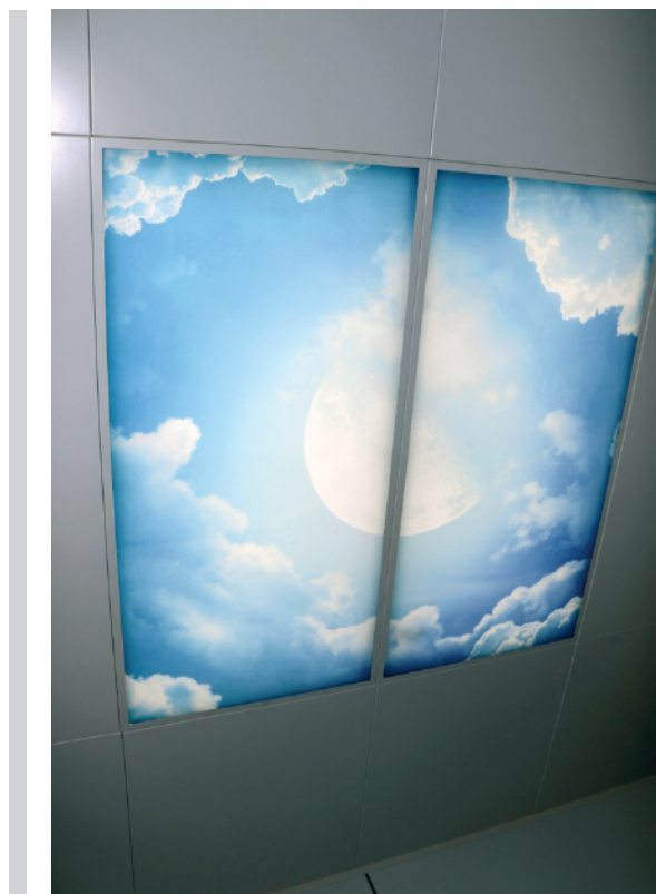
Figure 7. The LED Skylight as innovative ceiling finishing in treatment rooms in hospital, 2016, Photography: A. Gębczyńska-Janowicz

Specialized ceiling tiles of rock wool and metal plates belong to the most popular solutions on the market. Metal plates are more often used in operating