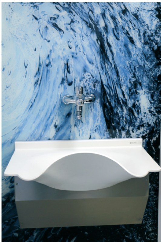
Figure 5. The glass wall with fixed graphics, 2016