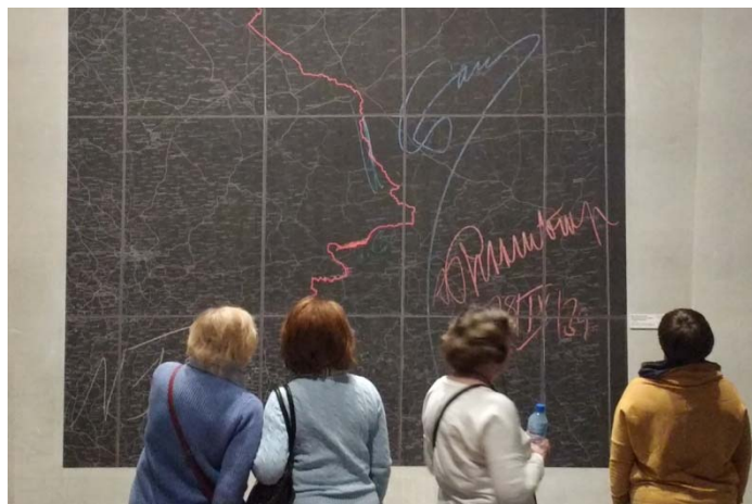
Figure 7. Visitors looking at the map showing the delimitation of the interests of the USSR and III Reich on the territory of the Second Polish Republic from 28.09.1939

emotions from visitors and at the same time, are a testament to those past times. It's also thanks to them, that the museum attracts so many visitors.