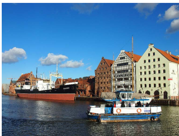
Figure 2. View from Długie Pobrzeże Street on buildings of The National Maritime Museum. The boat is a water tram which connects Ołowianka Island with the Main City through Motława river.

They have been rebuilt with the original fragments left intact, at the same time finding a brand-new function for the buildings, rendering it possible to boost the recovery of the part of the city which is separated from the mainland by the Motława River canal. This location has a significant landscape value. The museum buildings are clearly visible from the Long Embankment (Długie Pobrzeże) - a commercial route of historic value - currently serving as a walking trail. Figure.2