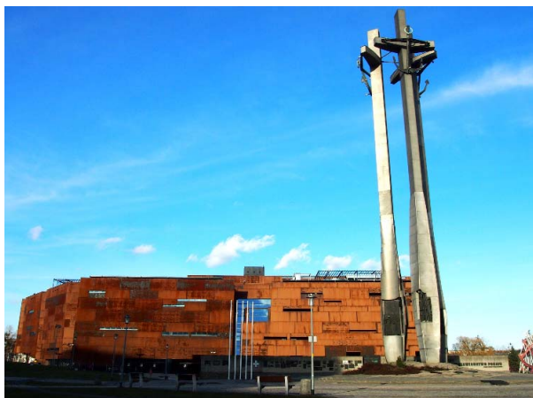
Figure 5. European Solidarity Centre is reminiscent of the hull of a ship. Three Crosses Monument, the symbol of the the Solidarity Movement is at the front of building.

Another cultural building is the European Solidarity Centre (ECS) opened in 2014. 1 It is situated in Śródmieście district, within the territory of the Young City, at Solidarity Square, in the vicinity of Gate No. 2 and the Three Crosses Monument - places related to the Solidarity Movement. The building houses permanent exhibition which in an interactive manner recounts the story of the Shipyard trade union - a movement which played the key role in the process of defeating communism in Poland and later in other Eastern European countries. Figure.5