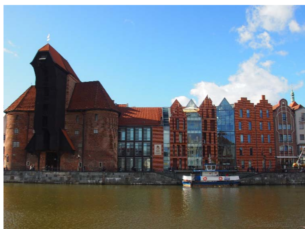
Figure 4. View from Ołowianka Island on The Maritime Cultural Center next to historic hallmark of Gdańsk - Żuraw.

The facades of the building recreate the rhythm of the former development, but with contrasting finishing materials: glass, dark wood and brick. Figure.4 This way, the unique character of the building may be emphasised which, at the same time, remains consistent with the aesthetics of the historic hallmark - the Gdańsk Żuraw. With a view to adapting to the existing architecture to the fullest extent possible and in the best manner possible and to make a reference to the past, a decision was made to incorporate ceramic materials, such as the Monk and Nun roof tiles, as well as manually formed and traditionally fired bricks of Gothic measurements.