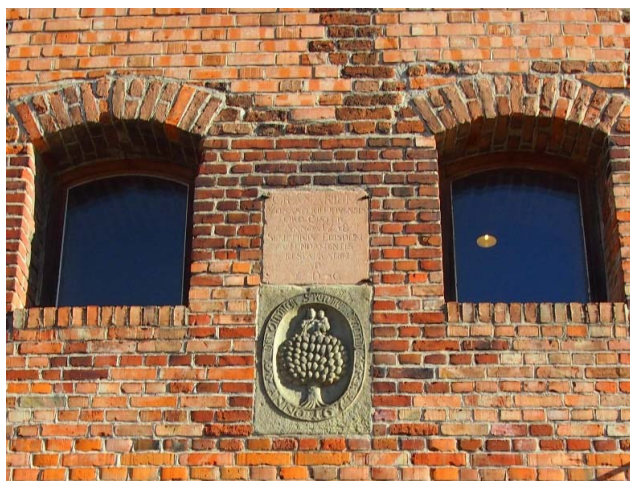
Figure 1. The reconstructed wall of the Baroque “Panna” granary.

They have been rebuilt with the original fragments left intact, at the same time finding a brand-new function for the buildings, rendering it possible to boost the recovery of the part of the city which is separated from the mainland by the Motława River canal. This location has a significant landscape value. The museum buildings are clearly visible from the Long Embankment (Długie Pobrzeże) - a commercial route of historic value - currently serving as a walking trail. Figure.2