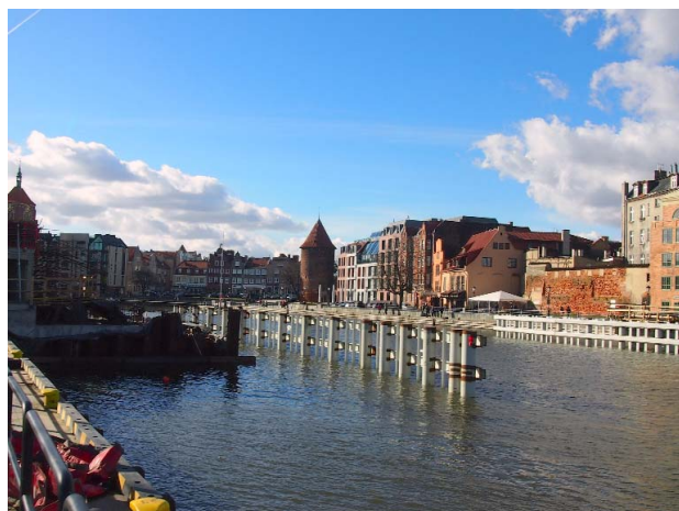
Figure 3. The place of a new bridge connecting the Ołowianka Island with the Old and Main Town