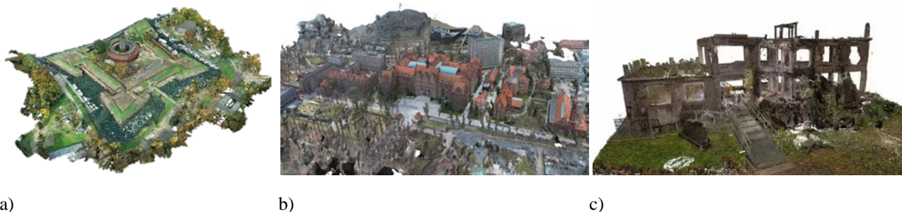
Figure 2: a) architectural object scale - photogrammetry model of the Wisloujście Fortress, Poland (developed during the Master and doctoral courses in the DAda Lab of the University of Pavia); b) urban scale campus to be used for projects of future campus development (developed by S. Kowalski and P. Bone in the Digital Architecture Laboratory at Gdańsk Tech); and c) point cloud acquired with use of the terrestrial laser scanner of New Barracks at the Westerplatte peninsula, Poland, showing the accurate inventory of objects in state of permanent ruin, and restricted access (developed by S. Kowalski in the Digital Architecture Laboratory at Gdańsk Tech).

Additionally, they gained insight into the potential use of UAVs, developing proficiency in drone piloting for remote sensing applications, flight planning, safety compliance and real-time data collection monitoring during flights. Handling the gathered databases necessitated knowledge of importing photos, selecting tie points, generating dense point clouds and creating textured 3D models from images. The training placed a strong emphasis on the methodology of utilising scanned objects as direct underlays for architectural projects.