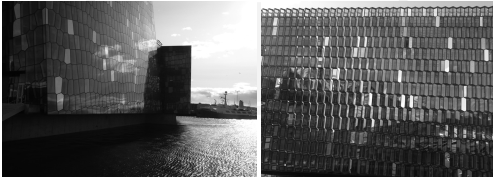
Ill. 5, 6. Harpa Concert Hall and Conference Centre

The recent use of optical filter technologies has opened up new possibilities for creating an image of the building facade as an envelope that deepens the sense of light and its variability, and consequently broadens the use of natural phenomena to create new aesthetics in architecture. Thanks to the new generation of optical filters that were created as a result of progress in materials science, facades that initiate a new relationship between inside and outside are being created; building envelopes are sensational transitory compositions of light and colorful landscapes whose common feature is volatility and unpredictability. The unique levels of sophistication of these heterogeneous para-natural compositions found on the facades, bring the built environment closer to natural conditions. By the visualization of and interaction with such facades, the range of aesthetic stimulus offered by architecture, can be greatly extended.