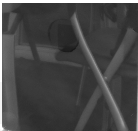
III. 2. Radiant colour film