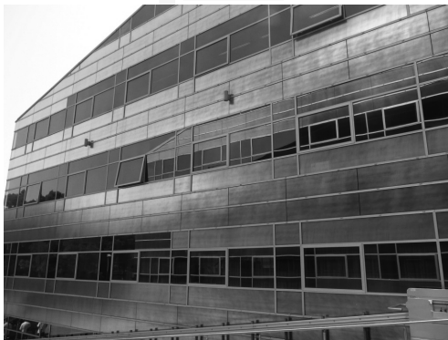
Ill. 3. Almere Business Center

The fascination with the phenomena of fission and refraction of light, and trials attempting to design the geometry of patterns of light that penetrate the interior, perfectly illustrate the work of artist and architect James Carpenter, and in particular Sweeney Chapel and Periscope Window. In the Sweeney Chapel in Indianapolis, a glass “truss” of vertical and horizontal bands of dichroic glass formed in the shape of a box – like kind of vertical coffer, creates a rhomboid grid of light patterns in shades of green, blue, yellow and violet on the wall of the presbytery that light off, depending on the time of day and light intensity. It was designed almost with “laboratory” lighting patterns, which are being constantly “disordered” by a nearby tree that interferes with the light flow and light reflections created by the dichroic bands.