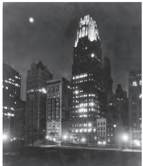
Figure 3 The American Radiator Building illuminated by Bassett Jones, as it appears at night, New York, in mid 1930s. The tower was specially designed in black brick and gold plating to have its color scheme reversed under nocturnal illumination.

As a result of many activities undertaken in the 1920s and 30s, there was an unexpected change in the attitude of architects. This