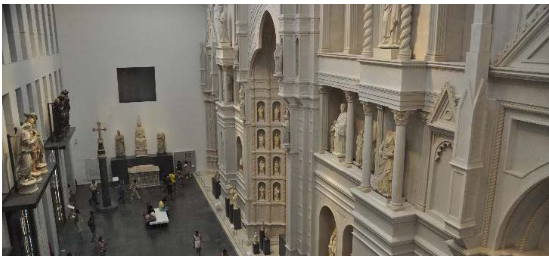
Figure 1: Interior of the Opera del Duomo Museum in Florence, Italy, with a reconstructed copy of the façade at a 1:1 scale.

Physical models are frequently used, alongside the flat technical drawings, in the field of architecture to visualise and acquire a fully complementary representation of the designed object during the project phase. The aim is to test the worked-out design in multiple contexts (historical, environmental, sociological, etc) by simulating the reality on the scale. What is more, during some design competitions, models and mock-ups are necessary to present the architectural idea and object in a complex way. One of the most famous uses of this technique is the project for the complementation of the dome in Florence's Santa Maria del Fiore Cathedral, represented by a wooden mock-up, which is still preserved in the Opera del Duomo Museum, Florence, Italy (Figure 1) [20][21]. During the project phase, many models, details and parts of the construction were represented at a scale of 1:1 or at a reduced scale to test them using physical factors or multiple tests to acquire construction simulations, e.g. loads distribution to optimise the design, and deformation and destruction patterns [22].