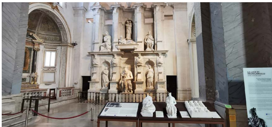
Figure 2: Laser-scanned and 3D printed representation to allow visitors to interact with elements of Michelangelo's Moses sculpture built into the tomb of Pope Julius II located in the Church of San Pietro in Vincoli in Rome, Italy [23].

Besides the academic and professional applications, models are frequently used in public spaces to educate and visualise the past shape of the city, spatial problems and unfinished concepts or allow the visitor to touch the duplicate shape of an untouchable object (e.g. extremely valuable statue of Michelangelo, shown in Figure 2). A series of architectural landmarks were also constructed as scale models dedicated to blind people, to visualise the shape and describe elements using typographic lettering.