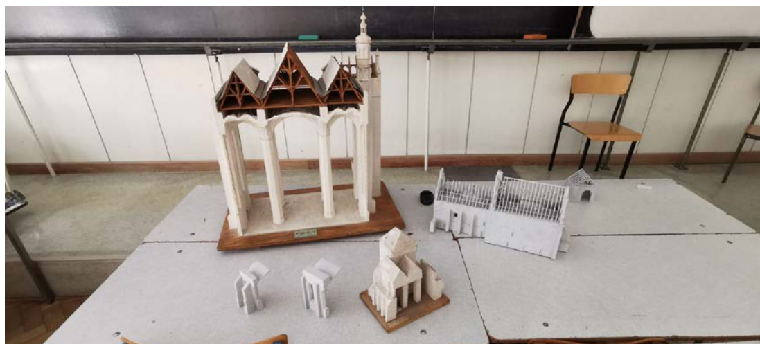
Figure 5: Multiple physical models, including gypsum, representing a section of St Peter and Paul's Church in Gdańsk at a 1:50 scale, made in 1959, and used during the History of Polish Architecture classes to stimulate and support the conducted lecture covering the topic of hall churches (photograph: Szymon Kowalski, 2021).

One specific task focused on the transfer of similar spatial solutions between different architectural objects. Around 1948, students from the Faculty of Architecture built a model of St Peter and Paul's Church - a Gothic hall temple that was partially demolished during WWII [31]. In 1959, there several models were made to stimulate and support the conducted lecture covering the topic of hall churches (Figure 5).