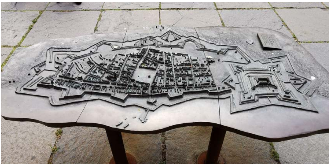
Figure 4: Bronze urban model of the city Malmö, Sweden in the 18th Century, with the perimeter of the fortifications. Displayed at the Malmö Castle (photograph: Szymon Kowalski, 2022).

With the popularisation of new technologies, such as 3D printing using multiple materials, such as polylactic acid (PLA), acrylonitrile butadiene styrene (ABS), polyethylene terephthalate glycol (PETG), and other types of plastics [25], ceramics, concrete [26] and even metal [27], new possibilities have emerged to speed up the process of creating such objects which dramatically increased the accuracy due to CAD drawings.