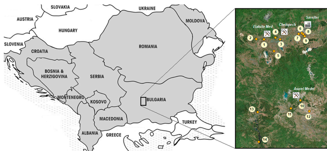
Fig. 1. Map of the study area and location of the sampling sites.