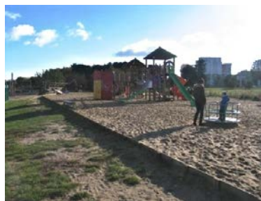
Photo 5. One of the children’s playground in Reagan’s Park; in the back - great housing estate of Gdansk, neighboring the park.