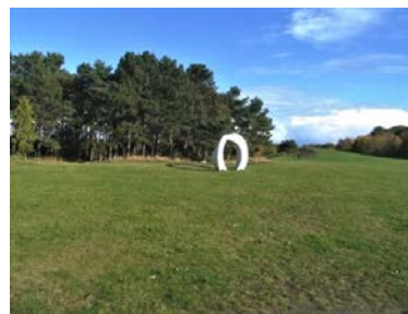
Photo 6. The art in the open space of Reagan’s Park, which may be divided from the city by the planned transit road.