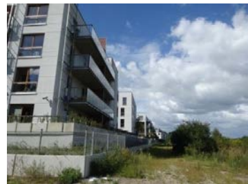
Photo 9. New gated communities, located in the open sea-side area. New activities like hotels and roads are being planned in this area.