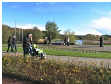
Photo 4. Reagan’s Park - the most popular in Gdansk sea-side recreational area; in the back the sculpture of Pope Jan Pawel II and President Ronald Reagan.