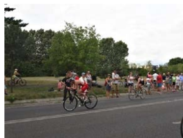
Photo 3. View on existing local street Czarny Dwor neighboring Reagan’s Park, which has to be transformed into transit road, during popular in Gdansk Triathlon, 2015.