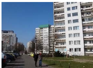
Photo 1. The inhabitants of the great housing estates of Gdansk have now a direct access to Reagan’s Park, sea-side and a sandy beach.

Its main value is magnitude and location between the housing estates (Photo 1) and sandy beach and the sea – main touristic attraction of Tri-city (Photo 2, Fig. 1).