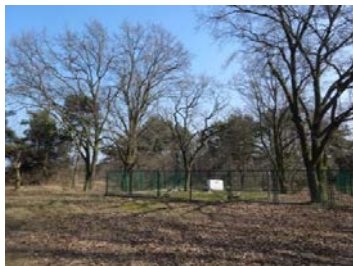
Photo 8. The endangered by new transit road Droga Zielona water intake of Czarny Dwor.