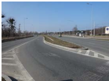
Photo 7. The fragment of already new built Droga Zielona. The continuation is to be built between Reagan’s Park and the city.

Droga Zielona may create serious environmental, landscape and social problems. It will become new technical barrier in the city, full of movement, lights and noise, separating recreational areas from the city (Photo 7). The other threat is the contamination of drinking water to the Gdansk’s inhabitants, because Droga Zielona will run through the zones of water protection (Photo 8). Another threat is possible farther development, like already built in the most attractive areas of sea-side belt gated communities. They create barriers in public space which should be open and accessible for everybody. They are precedence enabling future development in this unique area, like hotels and access roads (Photo 9). The area of silence, as the coastal belt is assessed nowadays, will be threaten by traffic noise. Technical barrier will make more complicated public access to the park and will cause negative environmental and landscape impacts. The planned road system will threaten unique in Poland recreational sea-side areas, intensively used by Gdansk inhabitants and thousands of tourists.