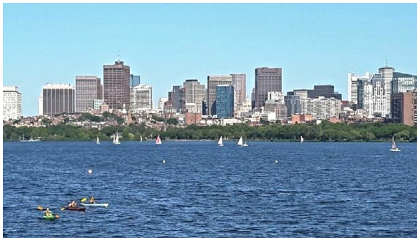
Fig.5. Charles River Esplanade. Skyline of Boston

informal name for the state-owned parkland also known as Charlesbank and Storrow Memorial Embankment. It is a three-mile leafy path along the Boston side of the Charles River, which separates the city from Cambridge. It was landscaped in the early 1930s and now attracts joggers, in-line skaters, cyclists, picnickers and sailing enthusiasts. The Esplanade parkland runs north of several Boston neighbourhoods: the West End, the Beacon Hill and Back Bay neighbourhoods, the Kenmore Square neighbourhood. The Esplanade is part of the Charles River Reservation, a linear park system that stretches along the Charles River for 17 miles that has an identity of its own (Fig. 3).