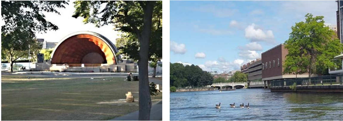
Fig. 6. Charles River Esplanade: Amphitheatre (photo left), Museum of Science, Boston (photo right)