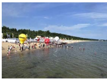
Photo 2. Sandy beach – the most picturesque landscape phenomena of Gdansk sea-side belt, the place of great events e.g. Triathlon 2015. The city is not visible from the beach.