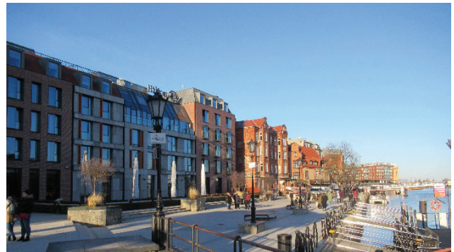
(b) Gdańsk: Long embankment