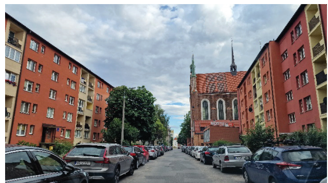
(d) Gdańsk: Rzeźnicza Street