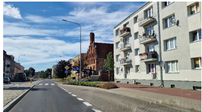
(b) Braniewo: Kościuszki Street