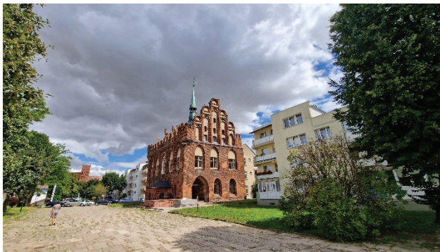
(a) Malbork: Old Town Hall within the rebuilt structures of the Old Town

Since the late-1950s, on many such sites, new districts have been erected in the style of socialist modernism , increasingly departing from the traditional model of the European city. What also made this period different from the Stalinist era was the fact that rebuilding processes were undertaken in the case of many cities, including numerous small and medium-sized ones. In these cases, new housing districts have been developed with the usage of industrialised technology on a large scale (Skolimowska, 2013). One such realisation is Malbork’s Old Town—as well as Braniewo, Kwidzyn, Kołobrzeg, Nysa, Legnica, Lwówek Śląski, and secondary old towns in larger cities, such as Stare Przedmieście in Gdańsk or Nowe Miasto in Wrocław (Bugalski, 2014; Figure 3). The author of the rebuilding concept for Malbork, Szczepan Baum, argued that there can be no compromise or intermediate phases between a strict historical reconstruction and the contemporary shaping of space (Baum, 1961). Indeed, although Malbork’s Old Town layer loosely refers to the historical city plan, it is almost impossible to identify former public spaces of the city with its main compositional axis of the elongated