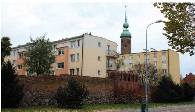
(c) Słupsk: Old Town as seen from Jagiełły Street