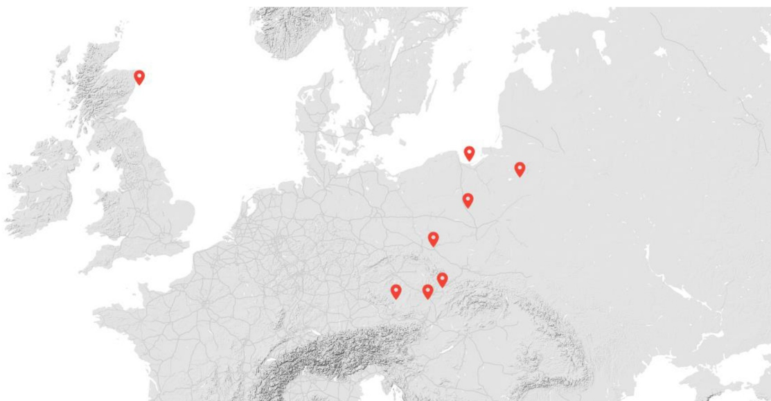
Fig. 1. Sampling points for the candidates for certified reference materials.