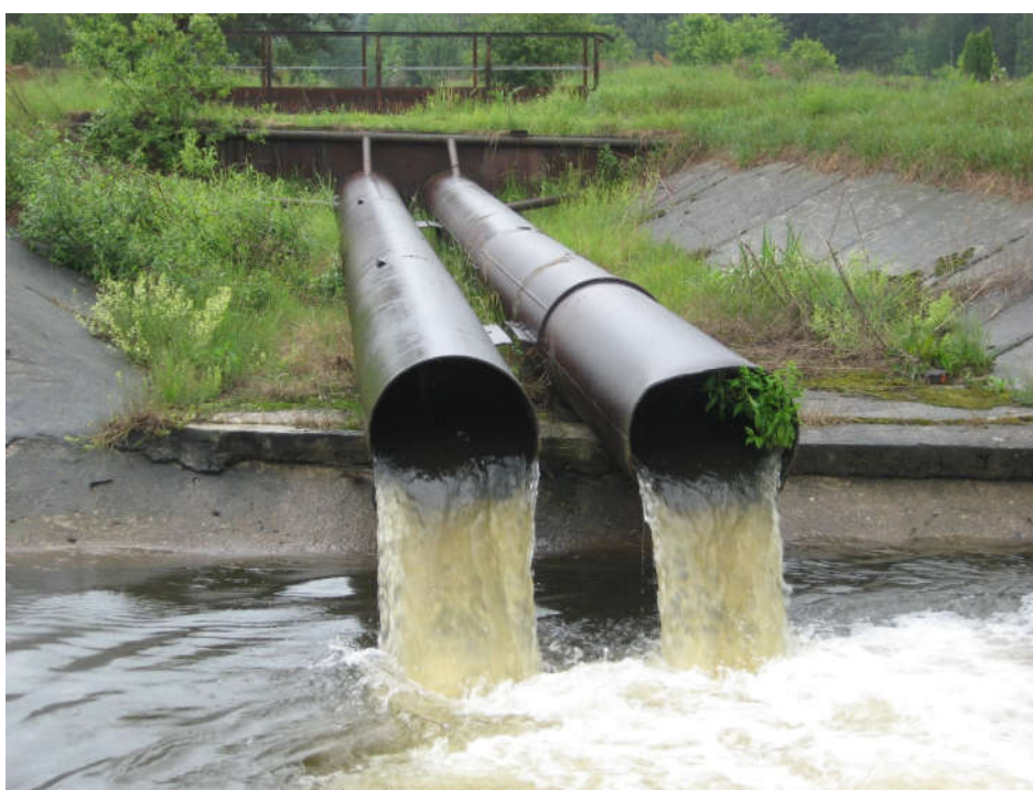
Figure 2. Discharge of brown coal mine waters treated in settling ponds.

Reducing conditions of water support the leaching of iron (II) and manganese (II) compounds from sediments as they are soluble in water [139,140]. After mixing with well-oxygenated surface waters, carbon dioxide is displaced from MW and enriched with dissolved oxygen from river waters. In such an oxidizing environment, iron (II) is oxidized to iron (III) and, to a lesser extent, manganese (II) to manganese (IV), and their insoluble hydroxides can be released from the sediments. This can cause a change in the color of the water (from yellow to brown) and turbidity (Figure 2), which can sometimes be very intense. Mine waters, especially from lignite deposits, can contain significant amounts of humic acids, which cause the additional colouring of these waters. These changes can affect the reach of solar radiation into the water, limiting plant cover and the number of taxa. A large proportion of lignite MW in the total river discharge can significantly disrupt the natural variability of the water temperature, which may also lead to disturbances in the functioning of biocenoses [135].