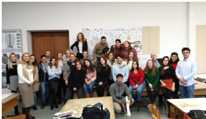
Figure 3: Final presentation of students' designs.

Working on the integration of urban and environmental solutions students developed original concepts. Among them were projects that presented new concepts for spatial development in an interesting way, with a special emphasis on public space. The best projects showed an integration of existing and designed space through the arrangement of public space, the role of which was revitalisation (of the space). Some projects incorporated attractors in the form of various functions (e.g. commercial, cultural, entertainment). In others, the creation of new connections was represented, to minimise existing barriers. The inclusion of sport and art as elements of public space also played an important role in students' designs. Public spaces are important in promoting a healthy lifestyle and encouraging various activities (Figures 3 and Figure 4) [11].