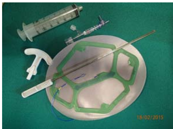
Fig. Ventralight ST with positioning set