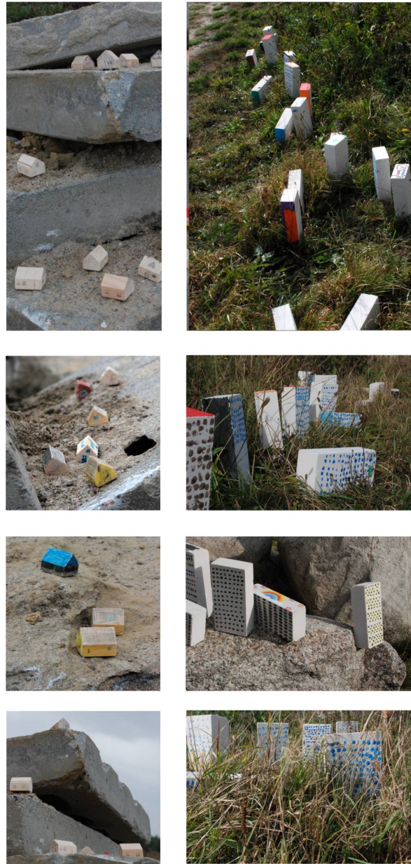
Figure 2. Workshops for children as part of the project entitled “ZASPA: dom w bloku. Przestrzenie archiTEKTURY” [ZASPA: a house in a block of flats. The spaces of architecture]”: wanderings.

material to work on. Windows were stamped onto it in order to resemble a large number of identical apartments.