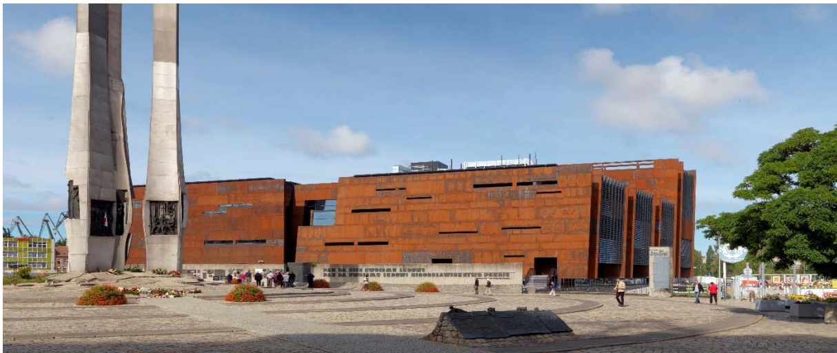
Figure 1. European Solidarity Center seen from Solidarity Square, photo: Wojciech Kryński, 2014.

The central point of the Square remains the monument of the three crosses. It is a space dominant (see Figure1). This spatial as well as symbolic role should not be questioned. That is why the building turns towards the square with raw metal plane almost without any holes, so as to descend to the background and become the screen for the statue's silhouette. The shadow of the cross rests on the flat surface of the façade, and their image literally and metaphorically deepens meaning of the building.