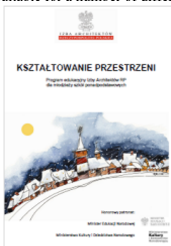
Figure 1. Shaping Space Programme.

Each of the parts consists of Introduction , ten lesson scenarios with the necessary teaching materials, student's worksheets, thematically related homework and proposals for interdisciplinary activities suitable for a number of different classes.