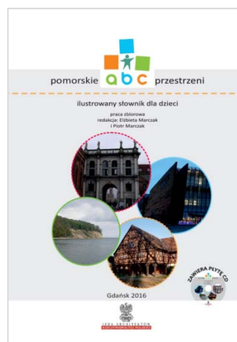
Figure 2. The dictionary Pomeranian ABC of Space

The Introduction provides the teacher with all the necessary guidelines for implementing the programme, such as educational assumptions and aims, required tools and materials, as well as tips on workspace arrangements.