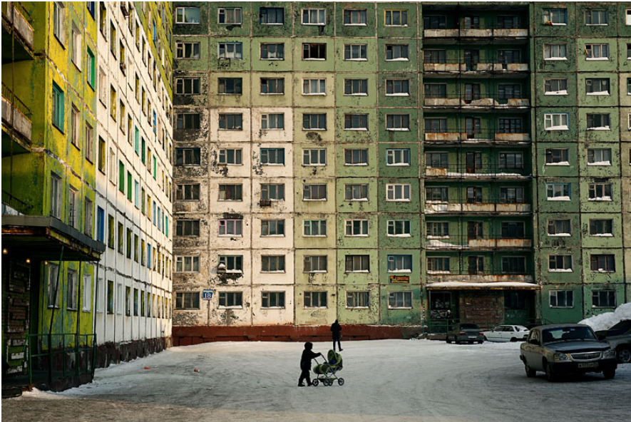
Figure. 2 In the city of Norilsk Source: Żółciak (2019).