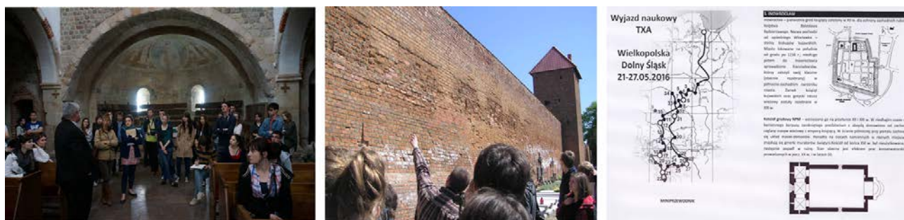
Figure 1: Students participating in the study tour classes (left and middle); an extract from a typical student guidebook, prepared before the study tour (right).

Students prepare for the tour by making mini guidebooks. They contain plans, sections of objects and the most crucial information (Figure 1). They help in recognising historical architecture and memorising its features. They are also a place to record comments and observations. Apart from domestic Polish tours, visits to selected European cities are also organised. These tours aim to expand knowledge about trends in architecture from neighbouring countries. They usually complement knowledge of Polish buildings, identifying similarities and differences.